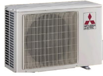
Outdoor Unit: MUZ-FH12NA