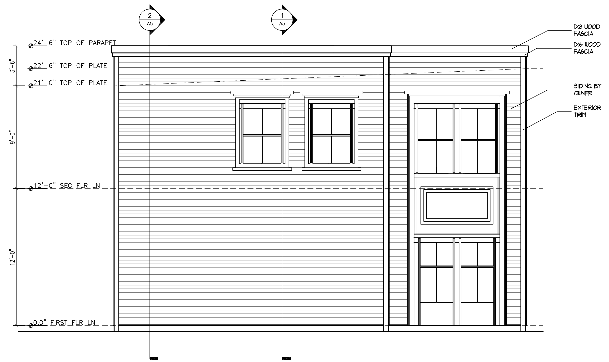
3 LEFT ELEVATION 1/4" = 1'-0"