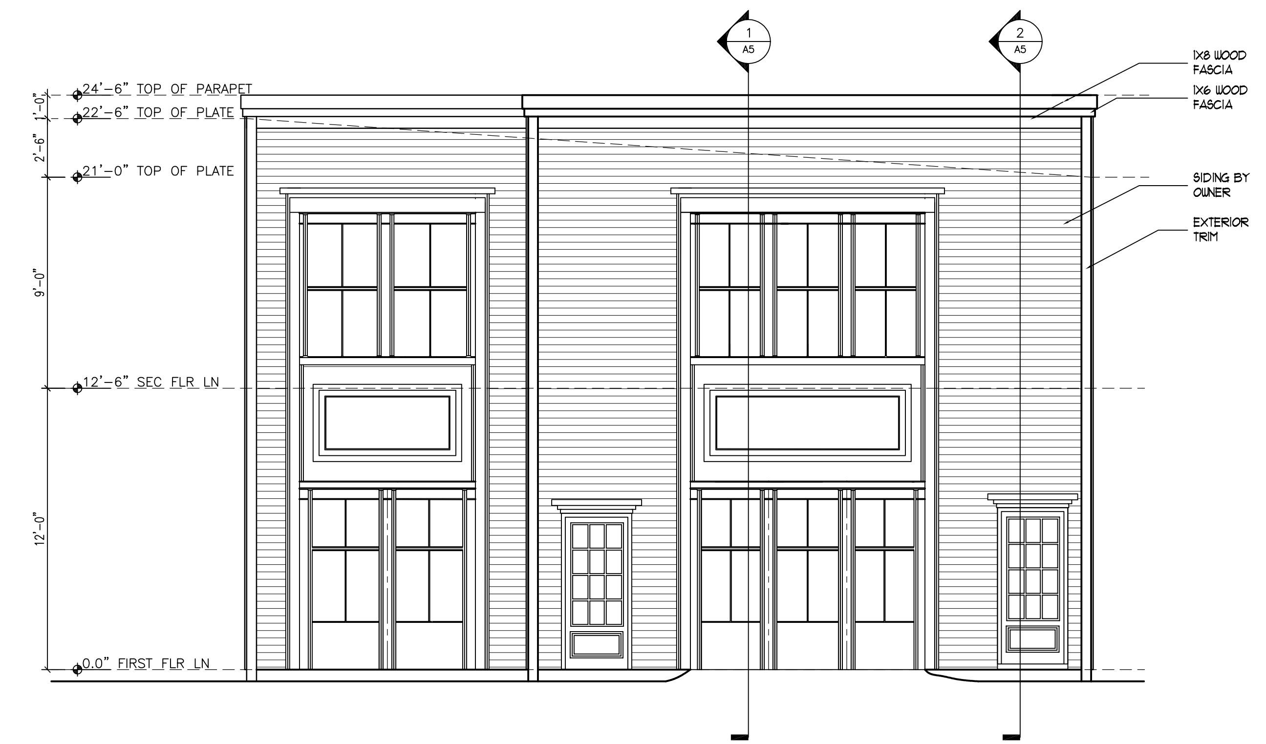
2 RIGHT ELEVATION 1/4" = 1'-0"