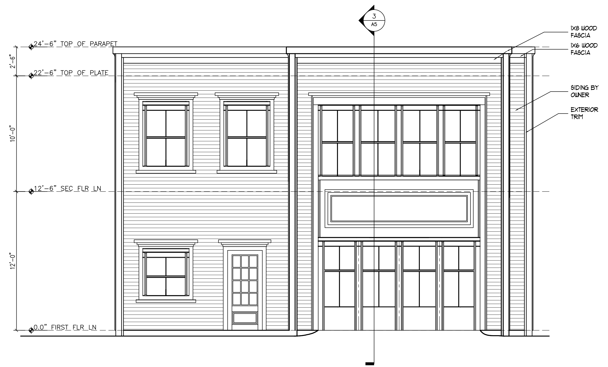
1 FRONT ELEVATION 1/4" = 1'-0"