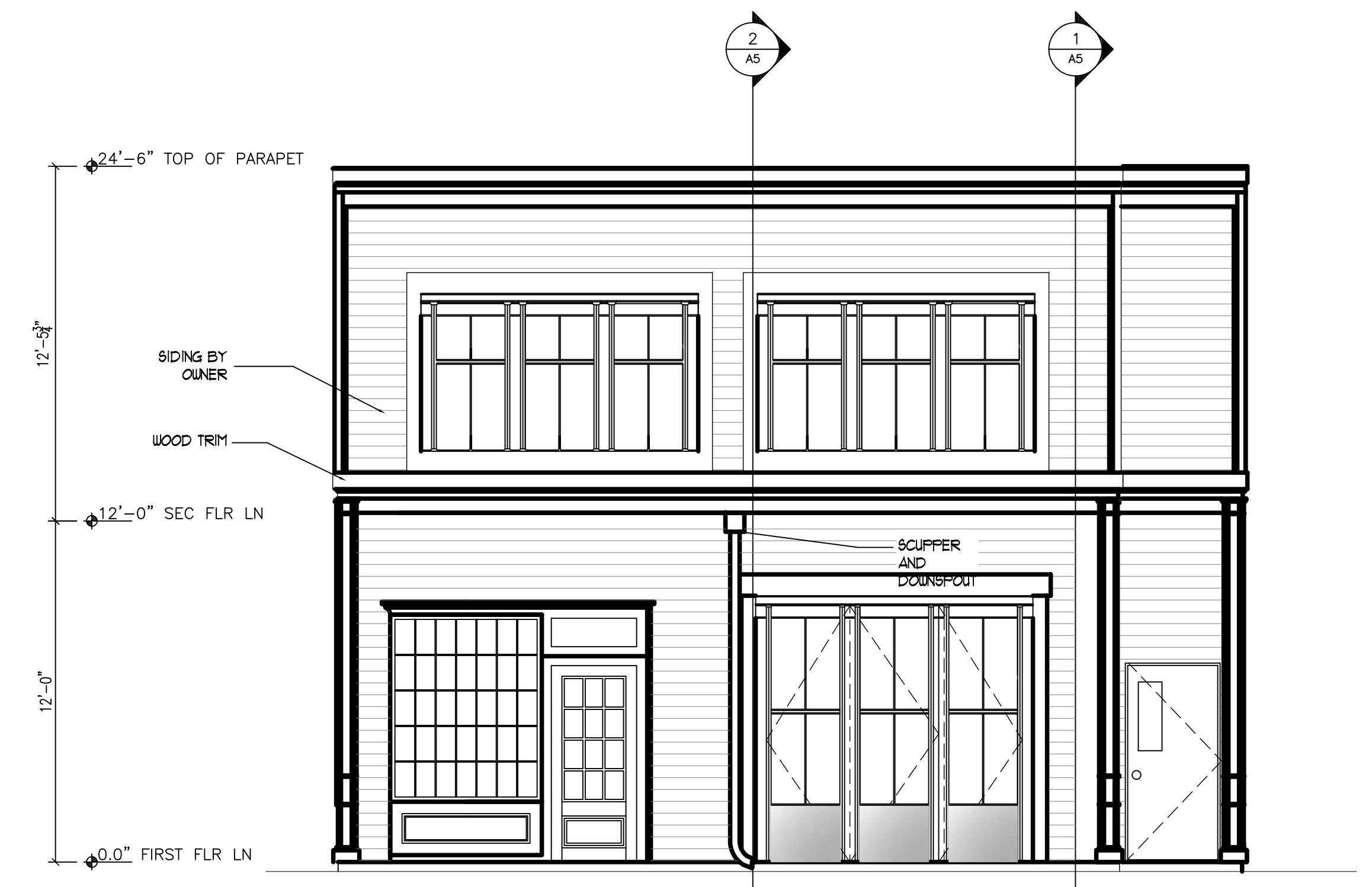
RIGHT SIDE ELEVATION SCALE: 1/4" = 1'-0"