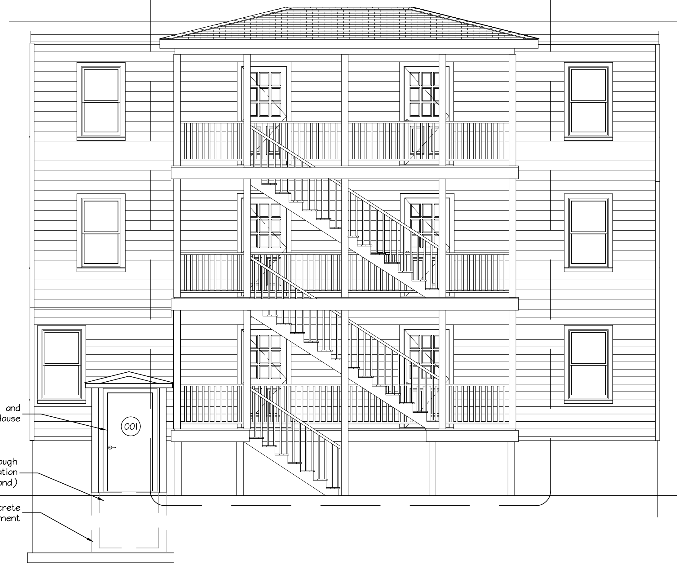
REAR ELEVATION Scale: 1/4" = 1'-0"

New Exterior Stairs See Details, Sht. A3 & S3