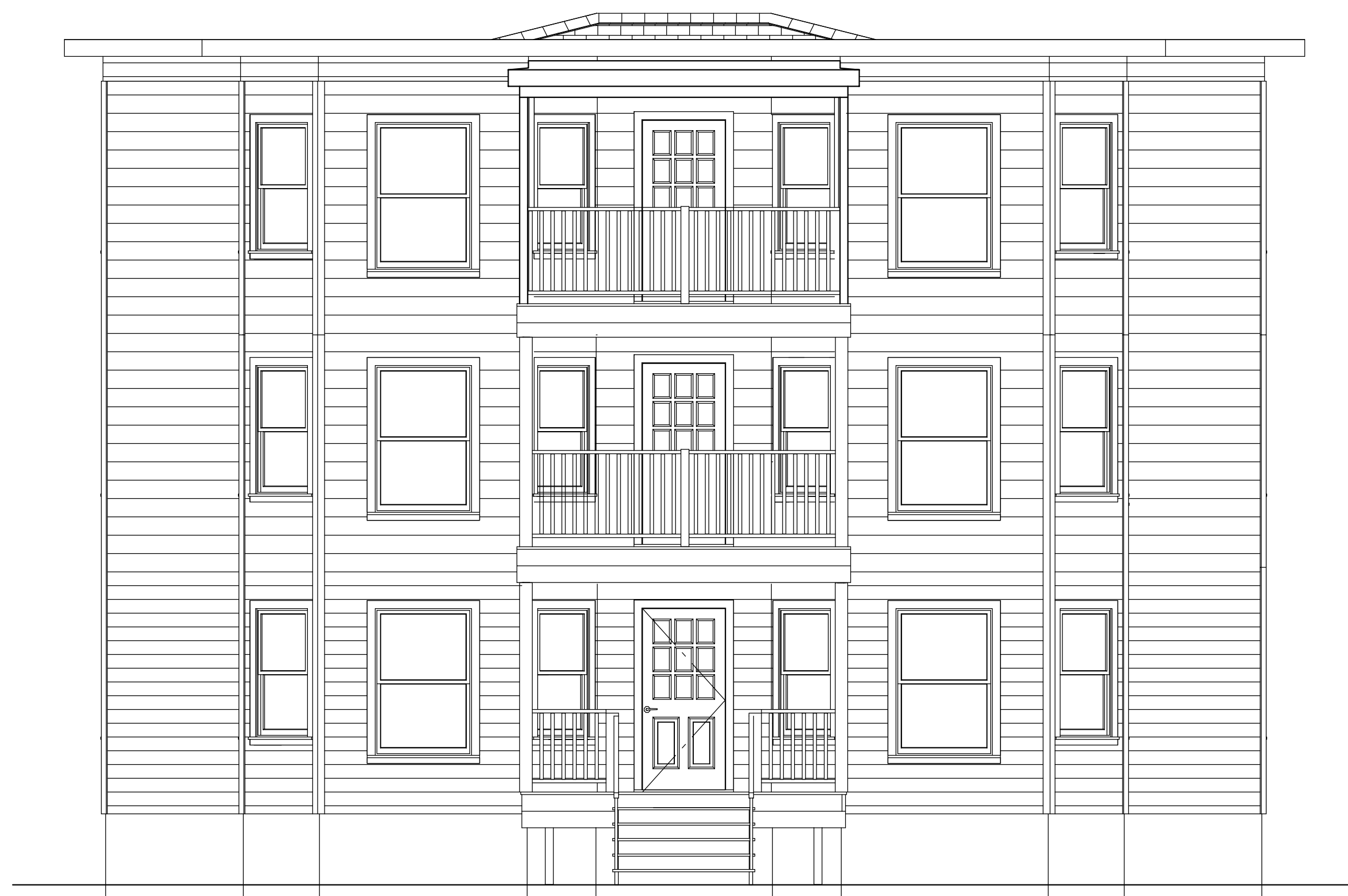
FRONT ELEVATION Scale: 1/4" = 1'-0"