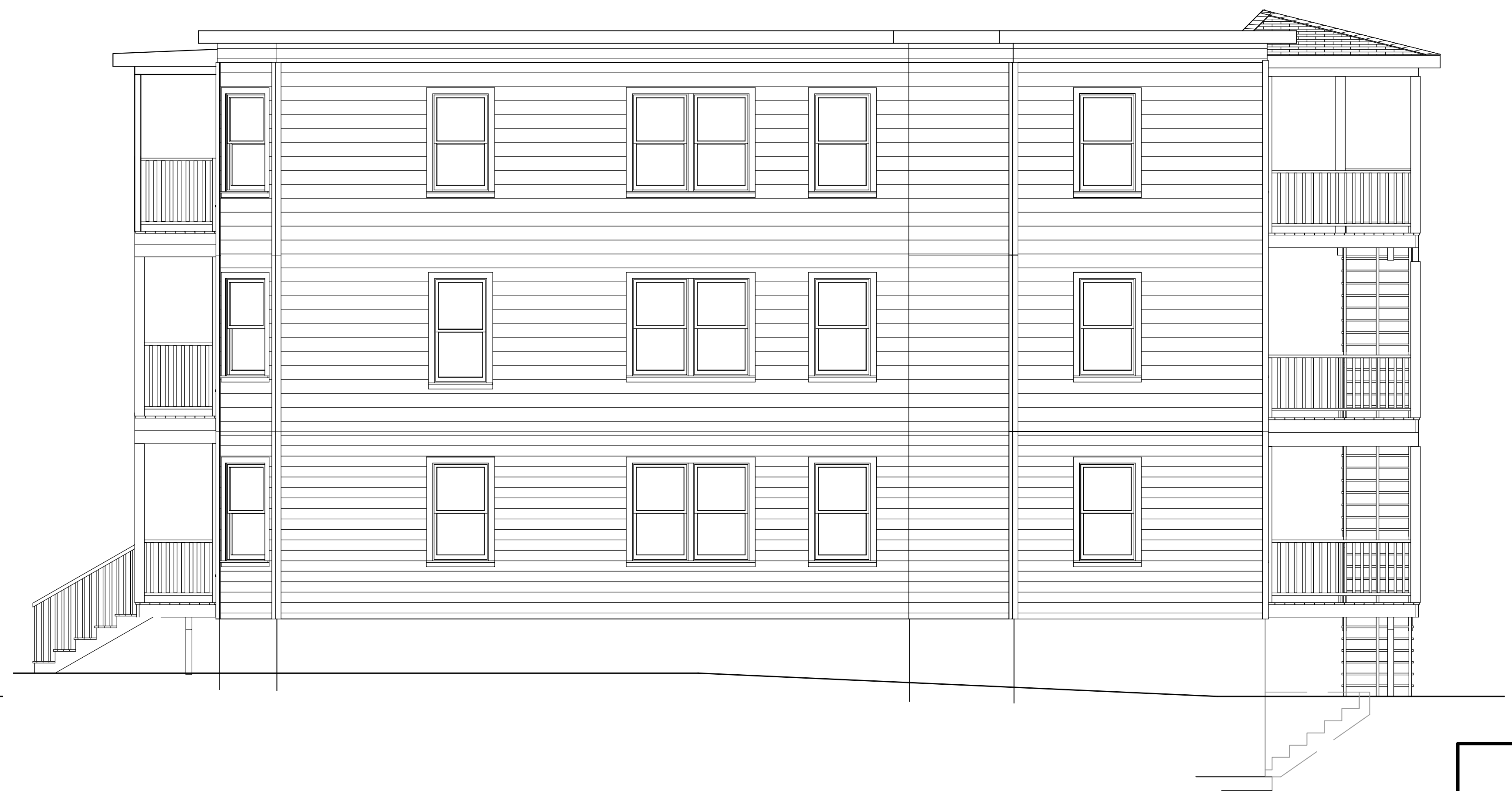
RIGHT SIDE ELEVATION Scale: 1/4" = 1'-0"

New Door and Dog House New Door 001 Through Existing Foundation Wall (Beyond) New Precast Concrete Bulkhead To Basement