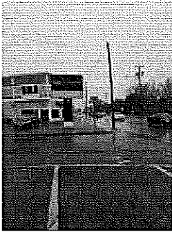
New sign placement.gif 4116K