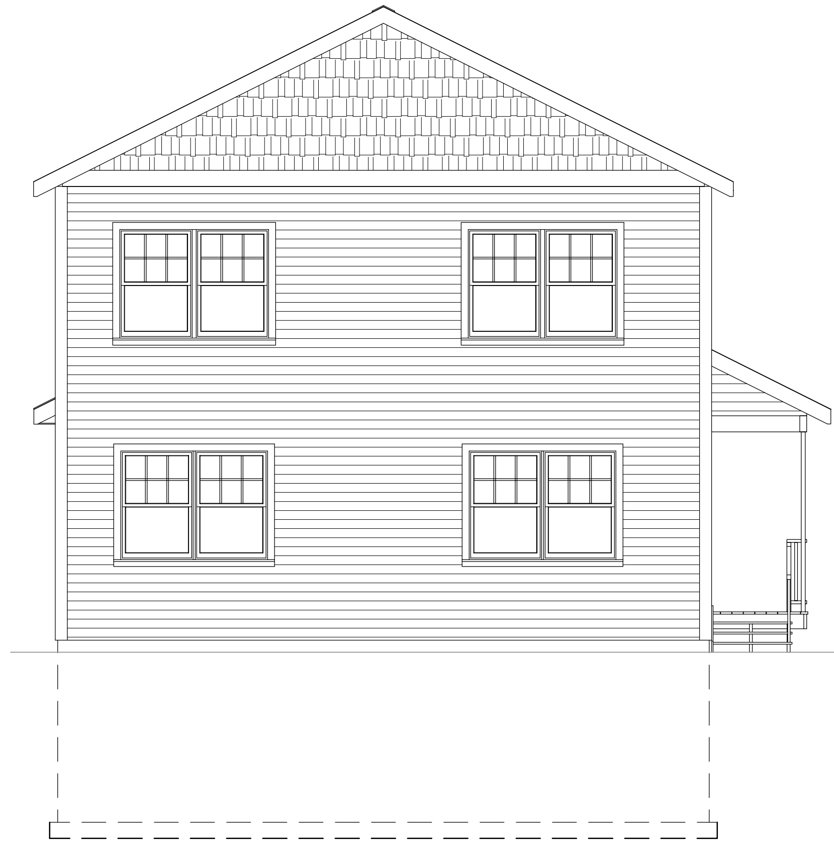
REAR ELEVATION Scale: 1/4" = 1'-0"