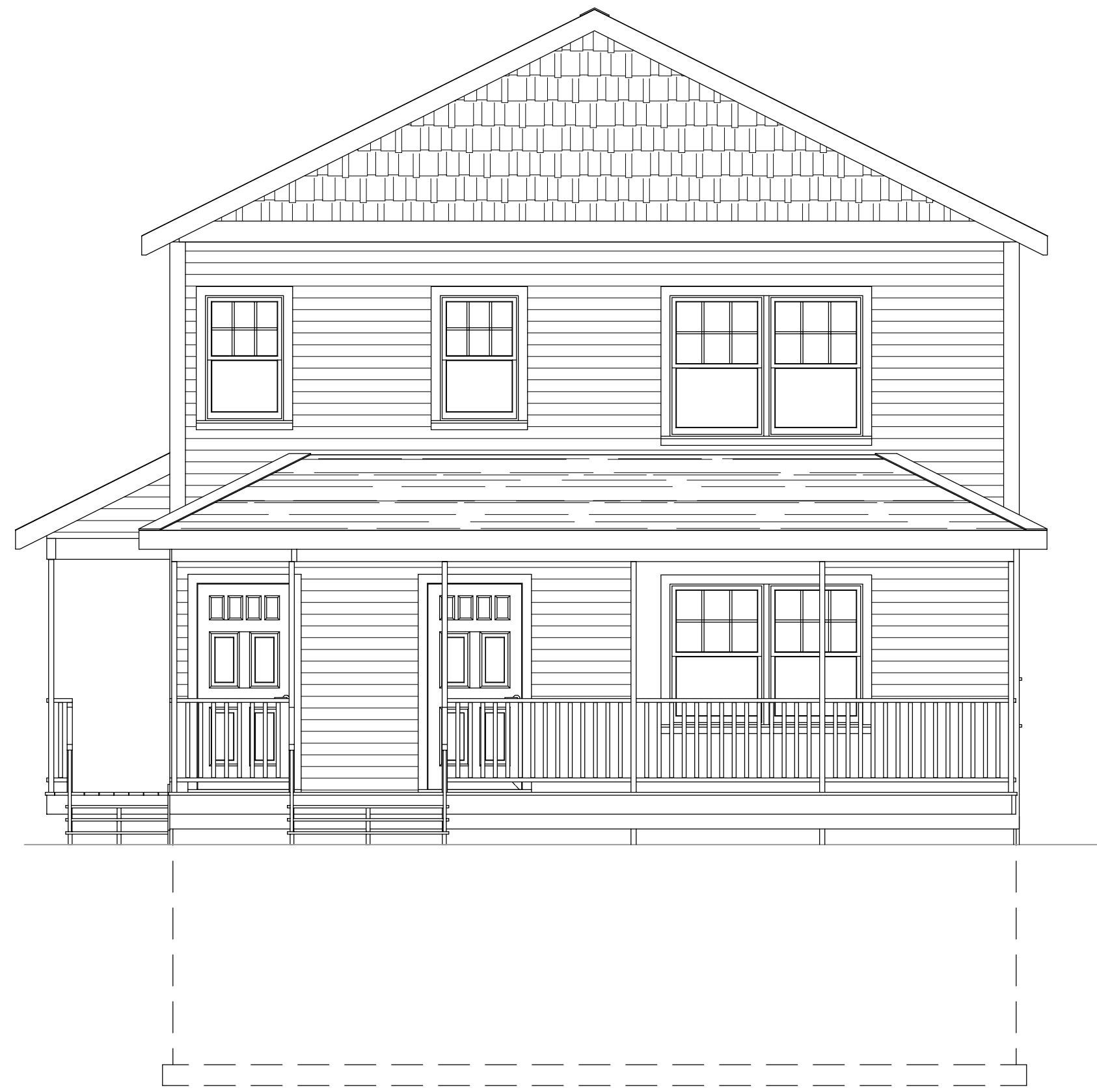
FRONT ELEVATION Scale: 1/4" = 1'-0"