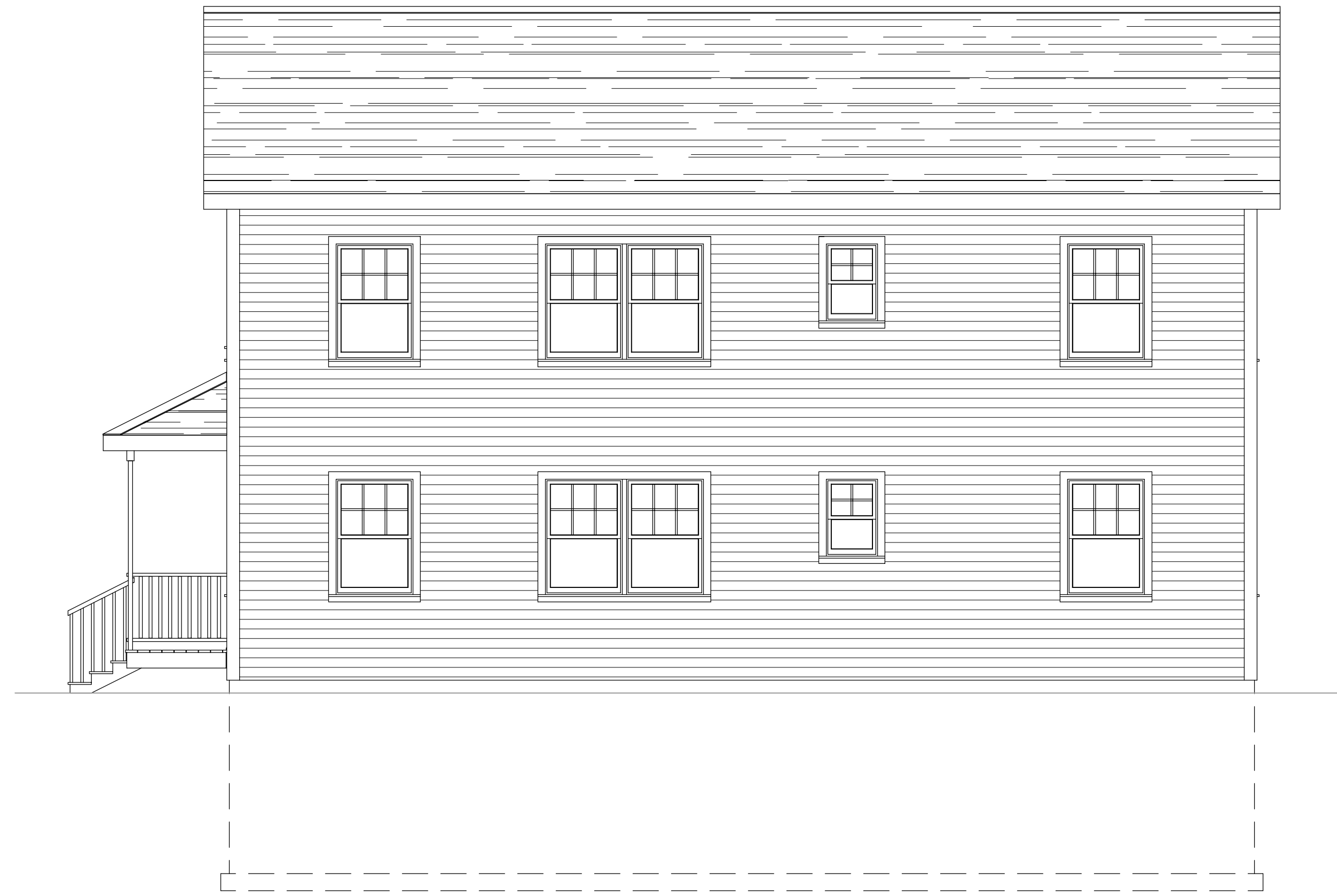
RIGHT SIDE ELEVATION Scale: 1/4" = 1'-0"