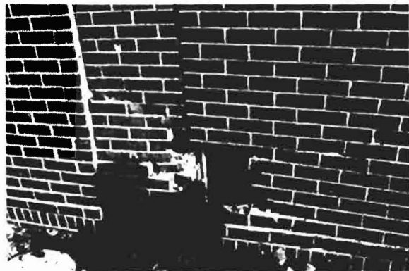
Figure 1: Picture shows the impacted wall.

At the time of the site visit, you indicated that a vehicle had impacted the side of the building on November 7th, 2009. The vehicle was traveling East on Woodford Street, made a left heading North on Forest Avenue when it lost control and struck the side of the building (see Figure 1). The vehicle made struck a brick pilaster and the adjacent brick wall just above the sidewalk level. A large section of brick wall is displaced due to the impact and the interior wood wall is shifted inward approximately 4 to 6 inches. Several cracks appear in the brick around the impact area. We did not observe any other significant damage to the building at this time.