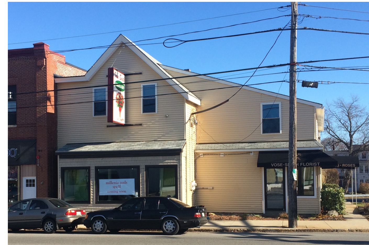
WEST ELEVATION FOREST AVENUE ELEVATION

NO SITE OR EXTERIOR WORK SIGNAGE UNDER SEPARATE PERMIT EXISTING PARKING SPACES VARY IN SIZE FROM 9' X 18' TO 10' X 20'