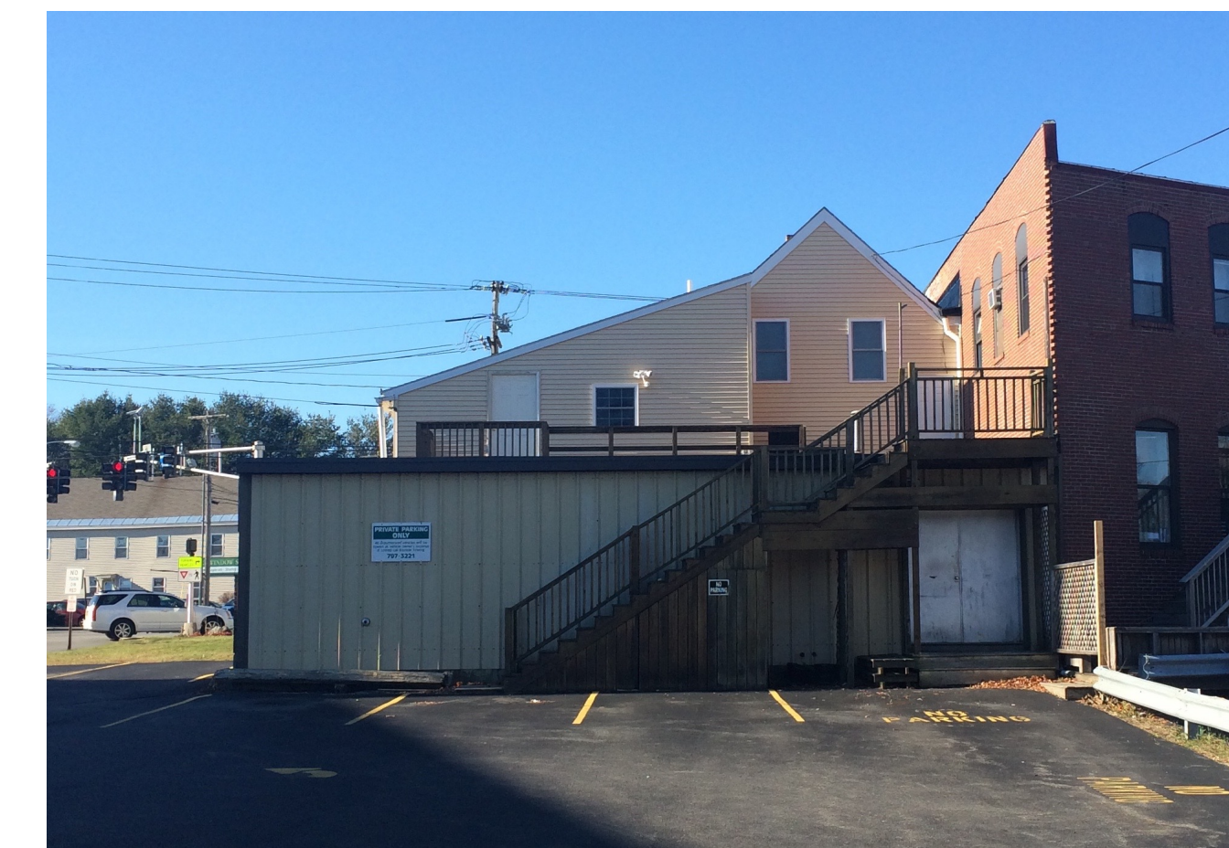
EAST ELEVATION GRACE STREET ELEVATION

NO EXTERIOR WORK PLANNED *EXCEPTION - REPAIR/REPLACE EXISTING DOUBLE HUNG OR GLIDER WINDOW TO MEET EGRESS REQUIREMENTS