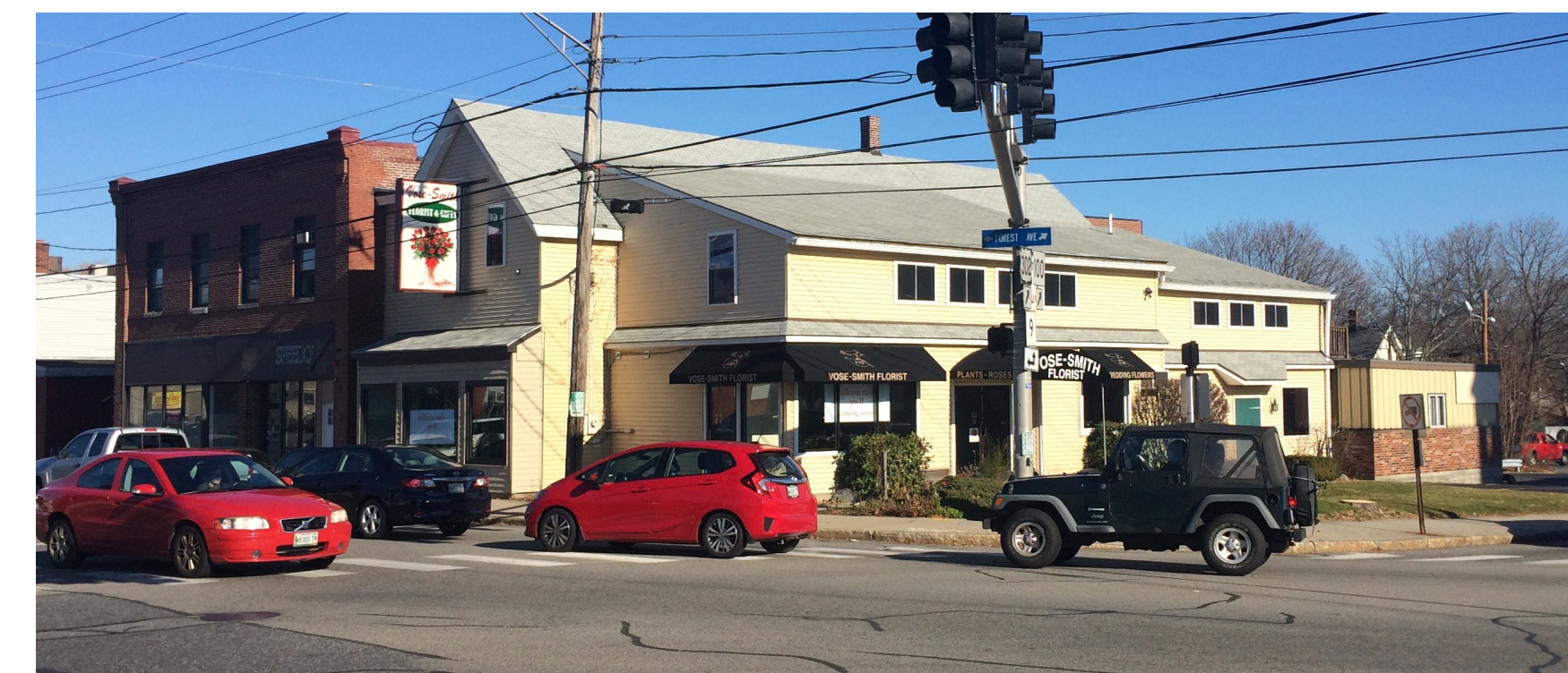
WEST & SOUTH ELEVATIONS FOREST AVENUE & WOODFORD STREET ELEVATION

NO EXTERIOR WORK PLANNED *EXCEPTION - REPAIR/REPLACE EXISTING DOUBLE HUNG OR GLIDER WINDOW TO MEET EGRESS REQUIREMENTS