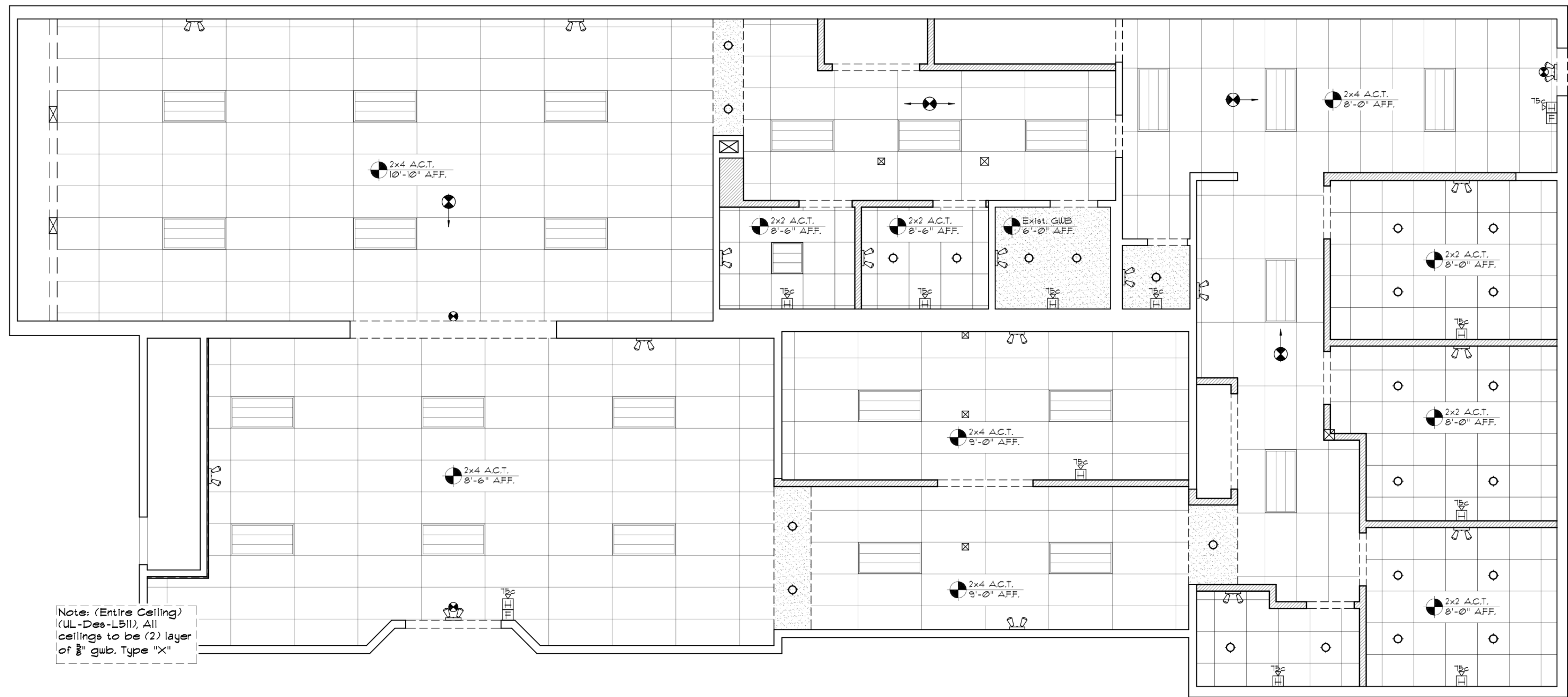
1 Finish/ Furniture Plan A-11 SCALE: 1/4" = 1'-0"

Note: Fire Alarm layout for reference ONLY (Fire Alarm shall be performed by a licensed Contractor Only)