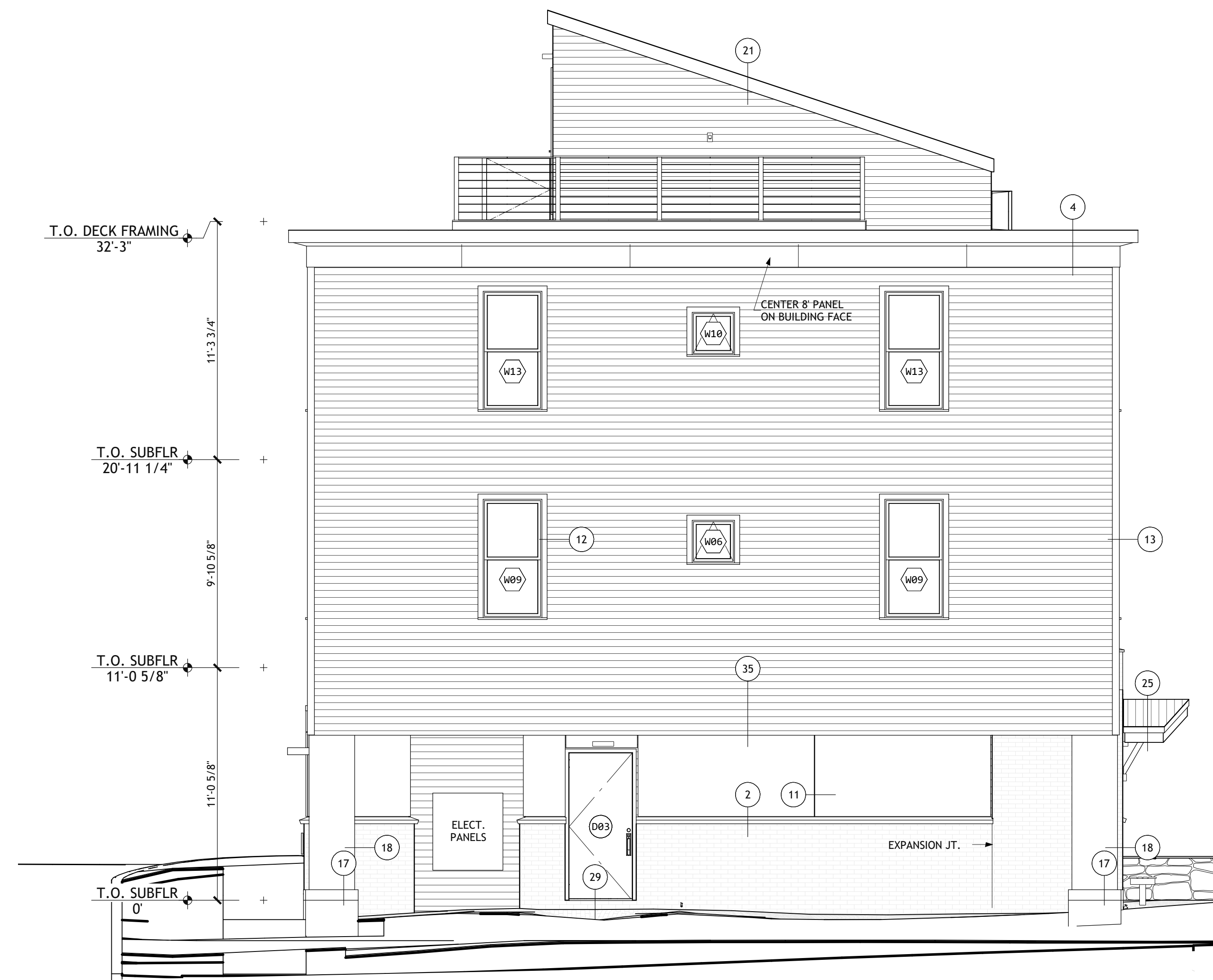
1 : East Elevation : 1/4 in = 1 ft