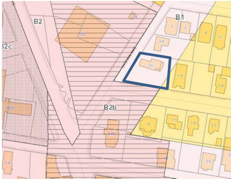
Figures 1, 2, and 3 (Clockwise from top right): 23 Ocean Avenue from above, showing existing building in office use; Site from the corner of Ocean Ave./Hersey St.; Zoning context