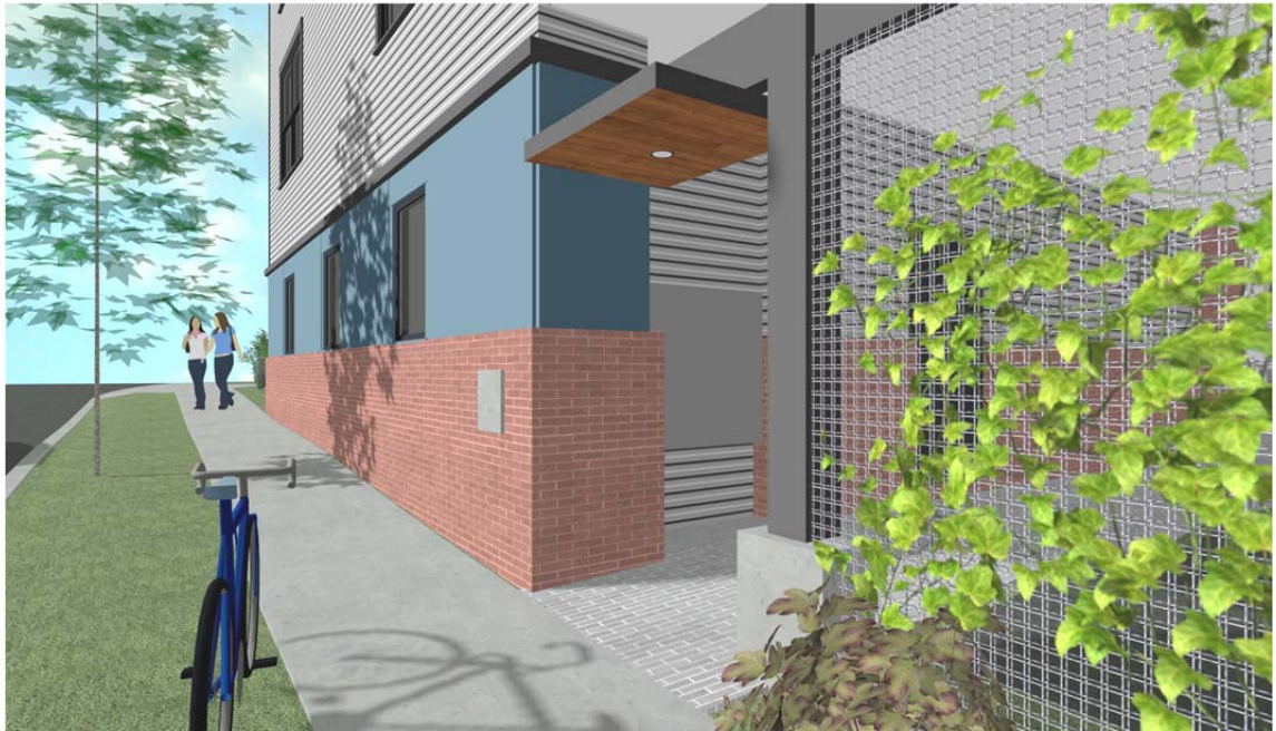
Figure 8: Hersey Street building entrance