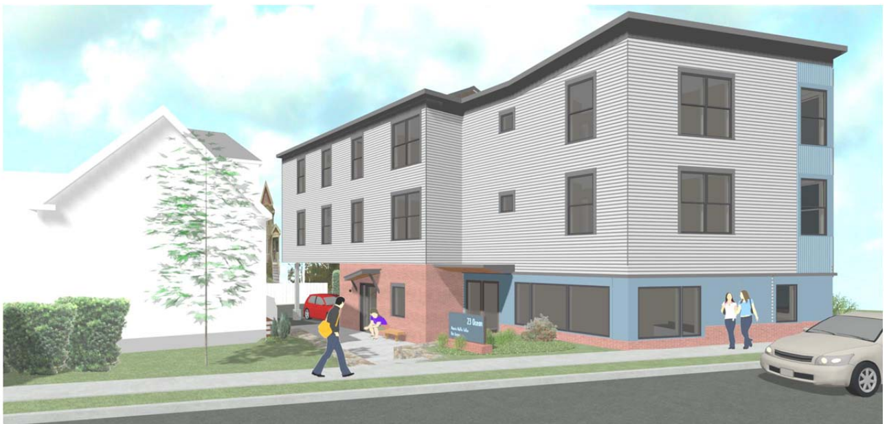
Figures 6 and 7: Final architecture from the corner of Hersey Street and Ocean Avenue (top) and Ocean Avenue looking south