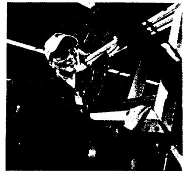
Our technology assures a worry-free product delivered to your home.

Our engineers, along with consumers, architects and contractors, created Society windows for a lifetime of worry-free operation. And our Higher Standard Lifetime Warranty™ is there for your peace of mind.