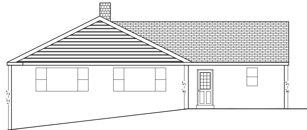
EXISTING REAR ELEVATION SCALE: 3/32" = 1'-0"