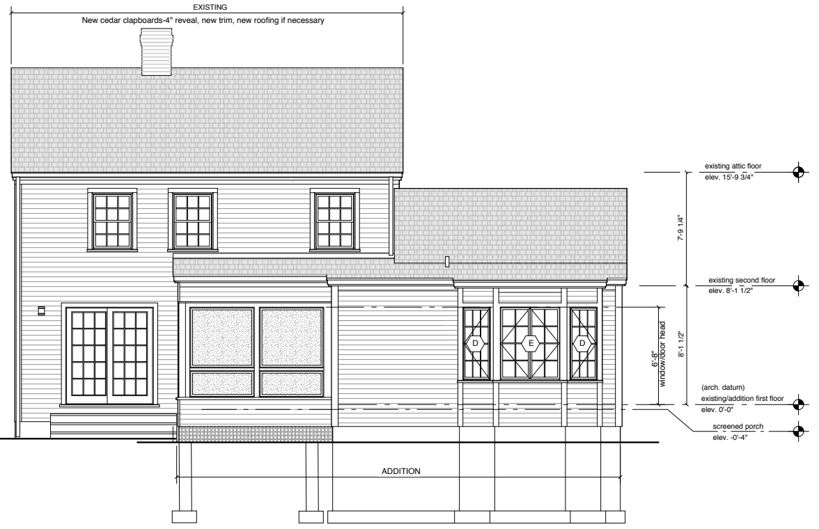
3 North Elevation SCALE: 1/4" = 1'-0"