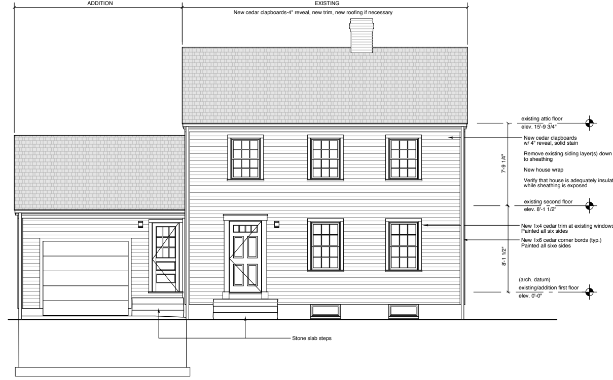
1 South Elevation SCALE: 1/4" = 1'-0"

Richard Renner Architects 61 Pleasant Street Suite 105 Portland, Maine 04101 207.773.8698 fax