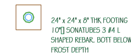
3 TYPICAL SONA TUBE 1/4" = 1'-0"