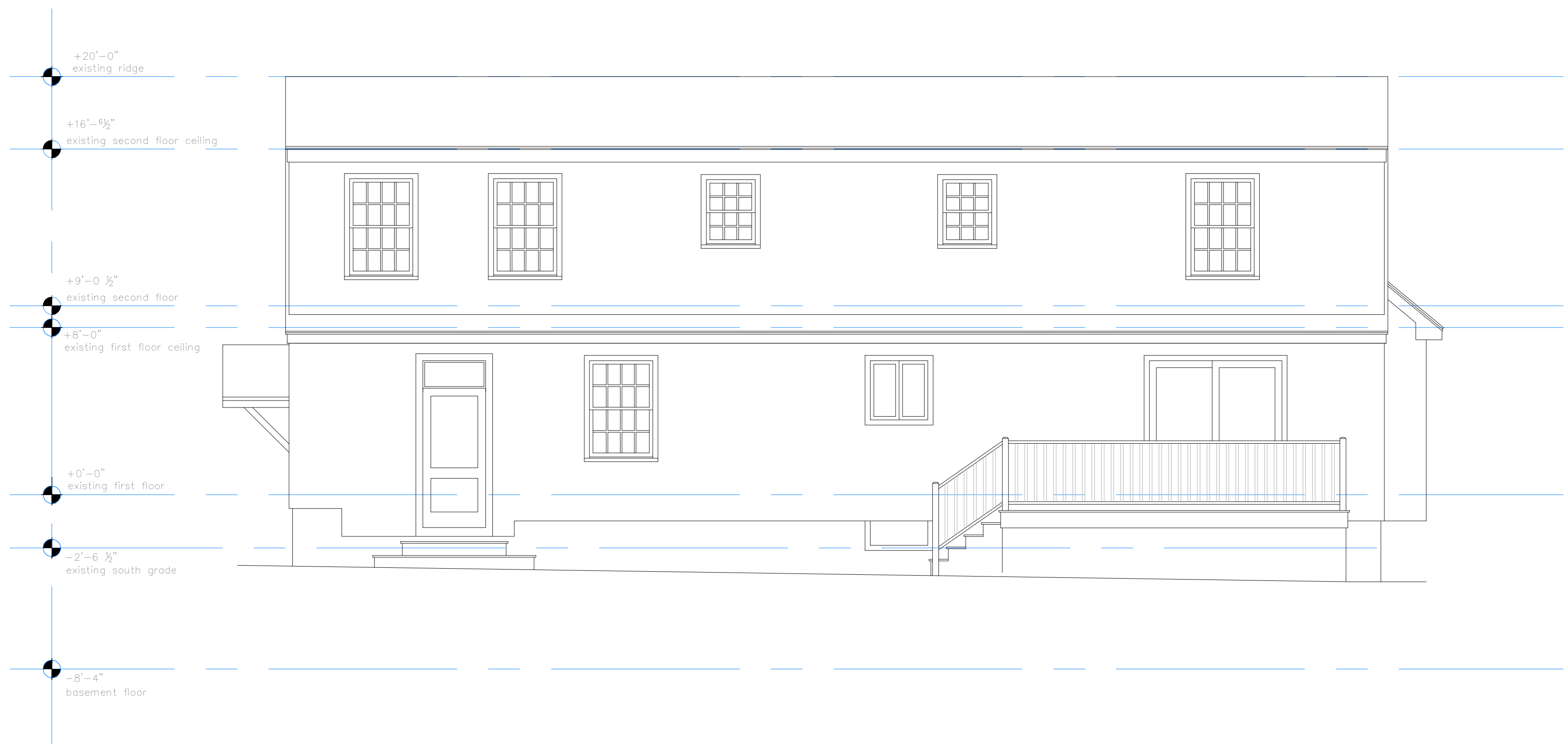
(A) Existing North Elevation 1/4" = 1'-0"