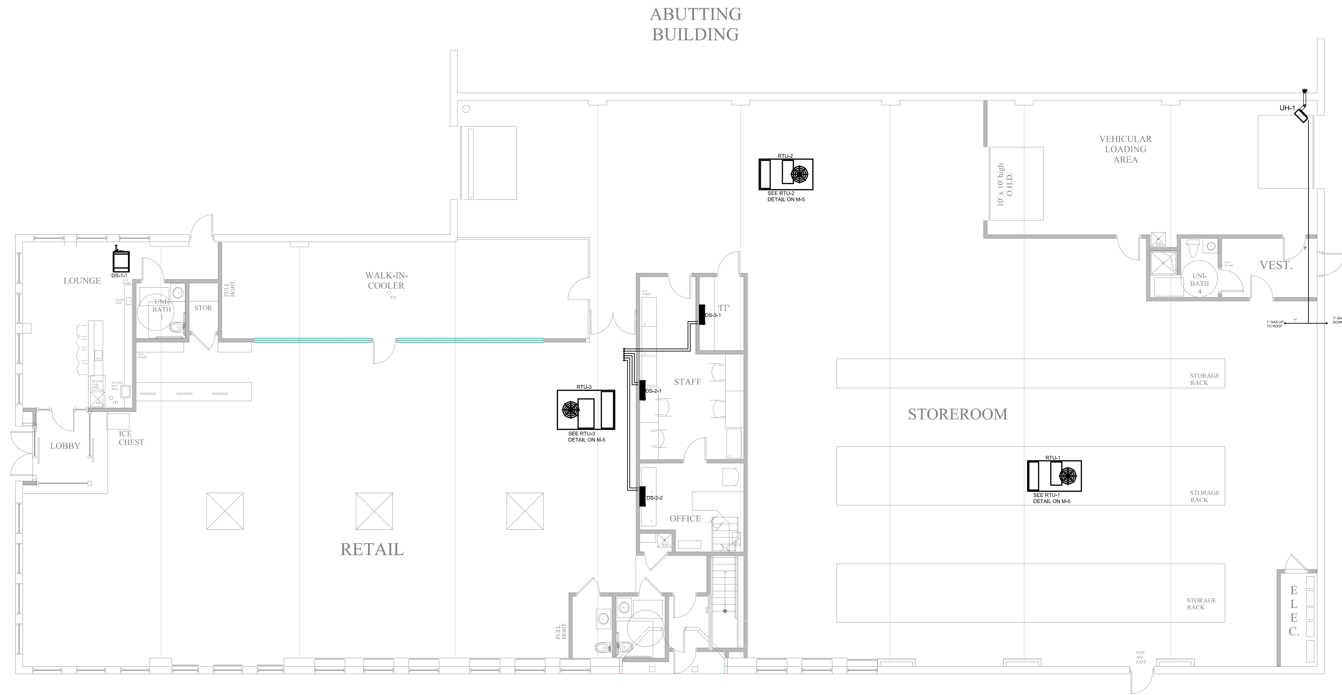
FIRST FLOOR PIPING PLAN SCALE: 1/8" = 1'-0"