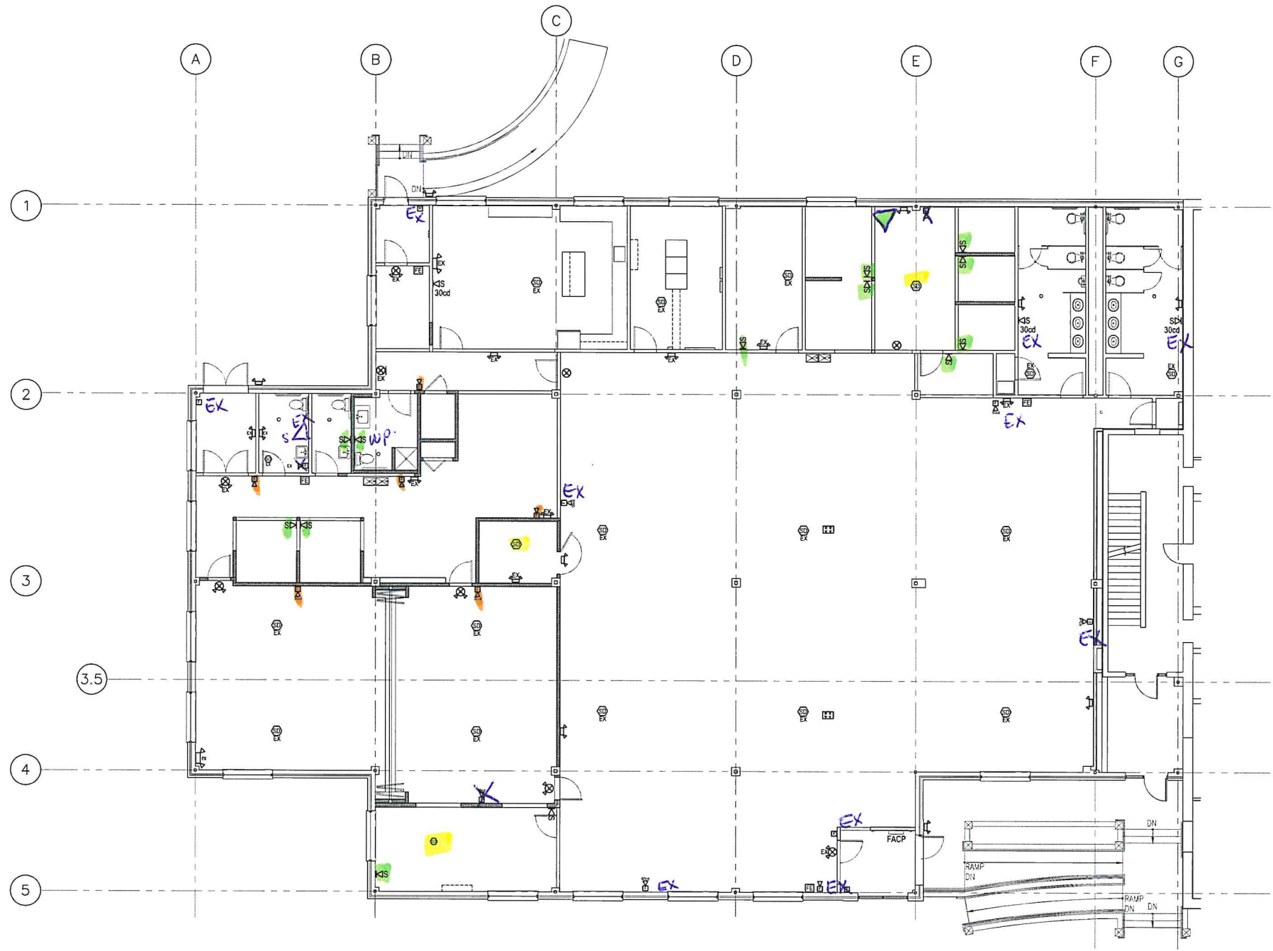
Life Safety Device Plan 1/8" = 1'-0"

Existing equipment; provide new devices as required to match existing devices