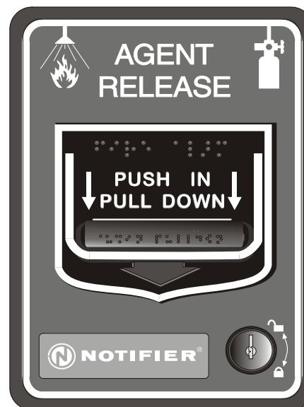
Dual Action NBG-12LR

FDNY: #6058 (NFS2-3030), #6038 (NFS2-640)