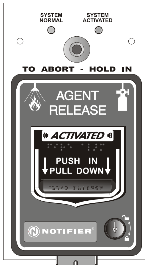
Dual Action NBG-12LR (shown activated)