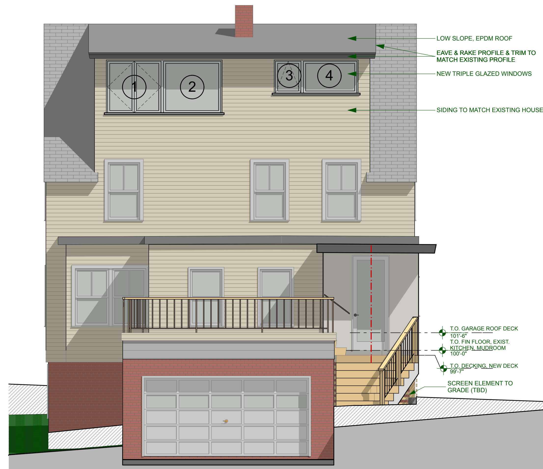
3 NORTH ELEVATION SCALE: 1/4" = 1'-0"