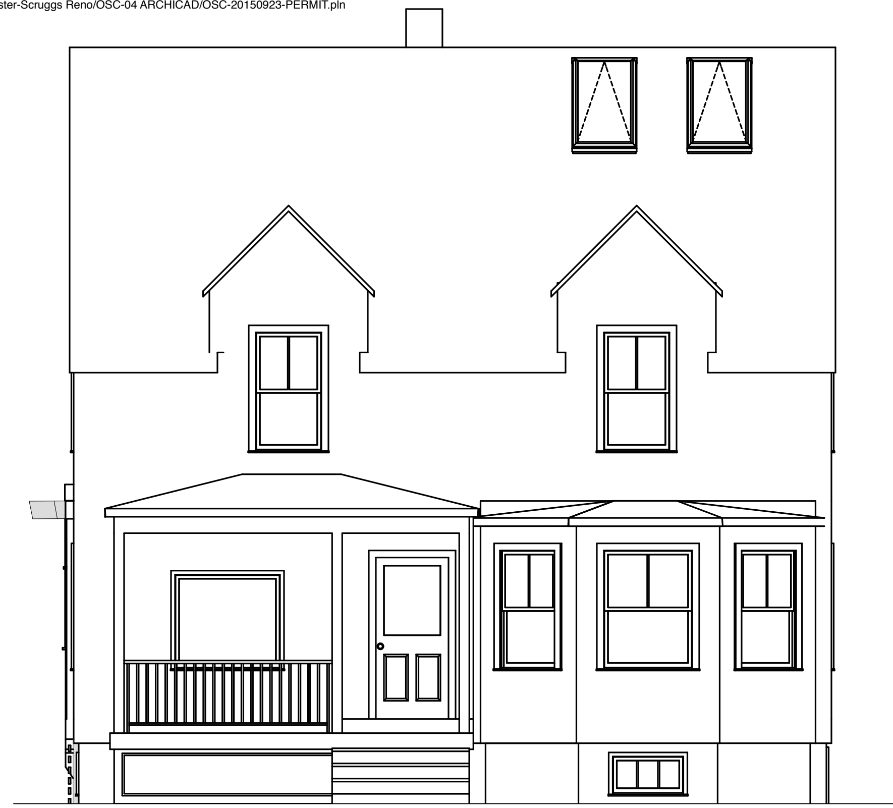
1 SOUTH ELEVATION SCALE: 1/4" = 1'-0"