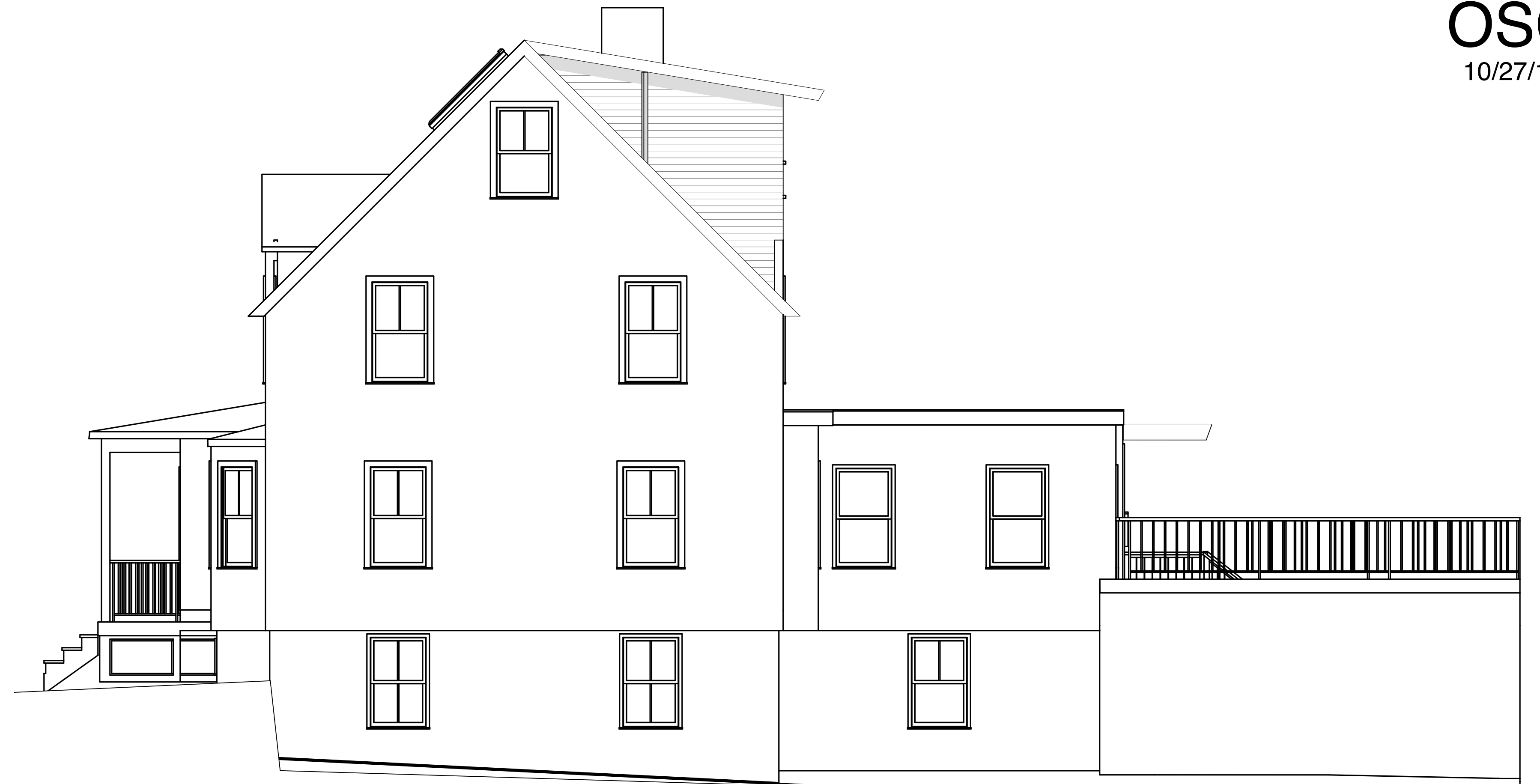
2 EAST ELEVATION SCALE: 1/4" = 1'-0"