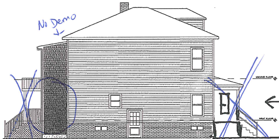
2 NORTH ELEVATION 1/4"=1'-0"