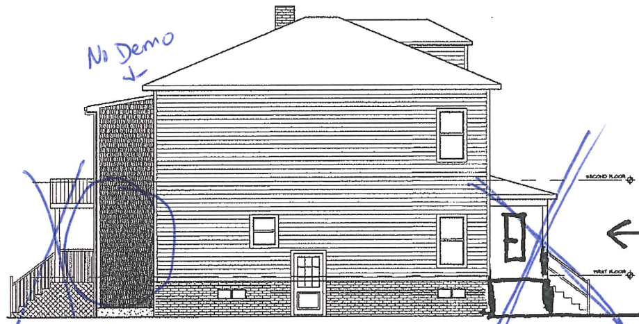
2 NORTH ELEVATION 1/4"=1'-0"