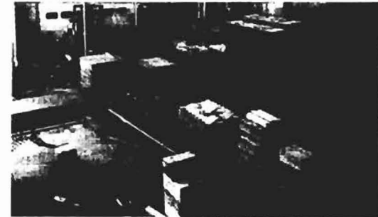
Our manufacturing facility is modern, efficient and climate controlled.

O ur price includes delivery and installation within 25 miles. We supply all concrete blocks for leveling. Outside of our free delivery range? We will deliver to most New England locations for $1.50/mi. after the first 25 miles from our store.