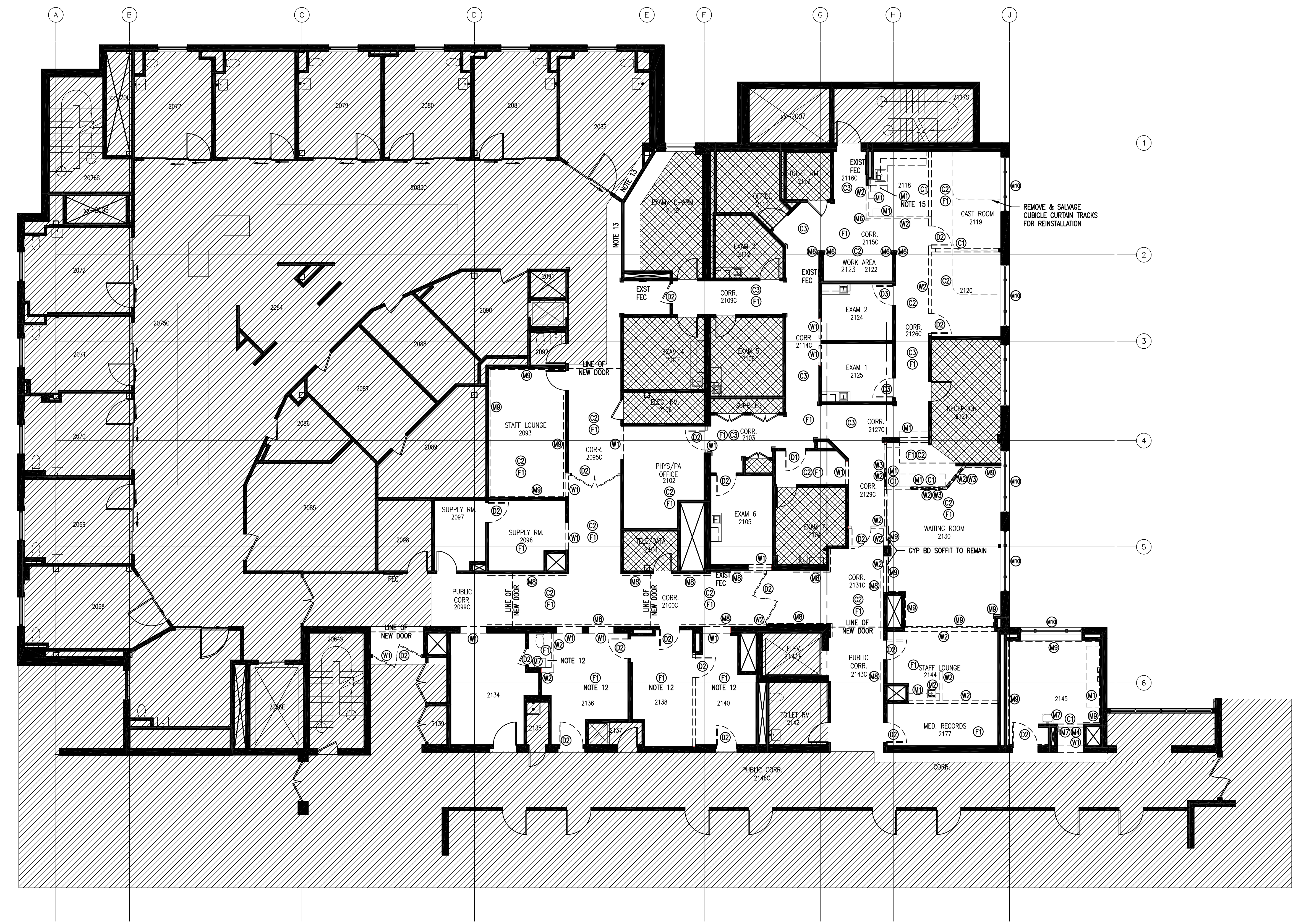
1 DEMOLITION PLAN 1/8" = 1'-0"