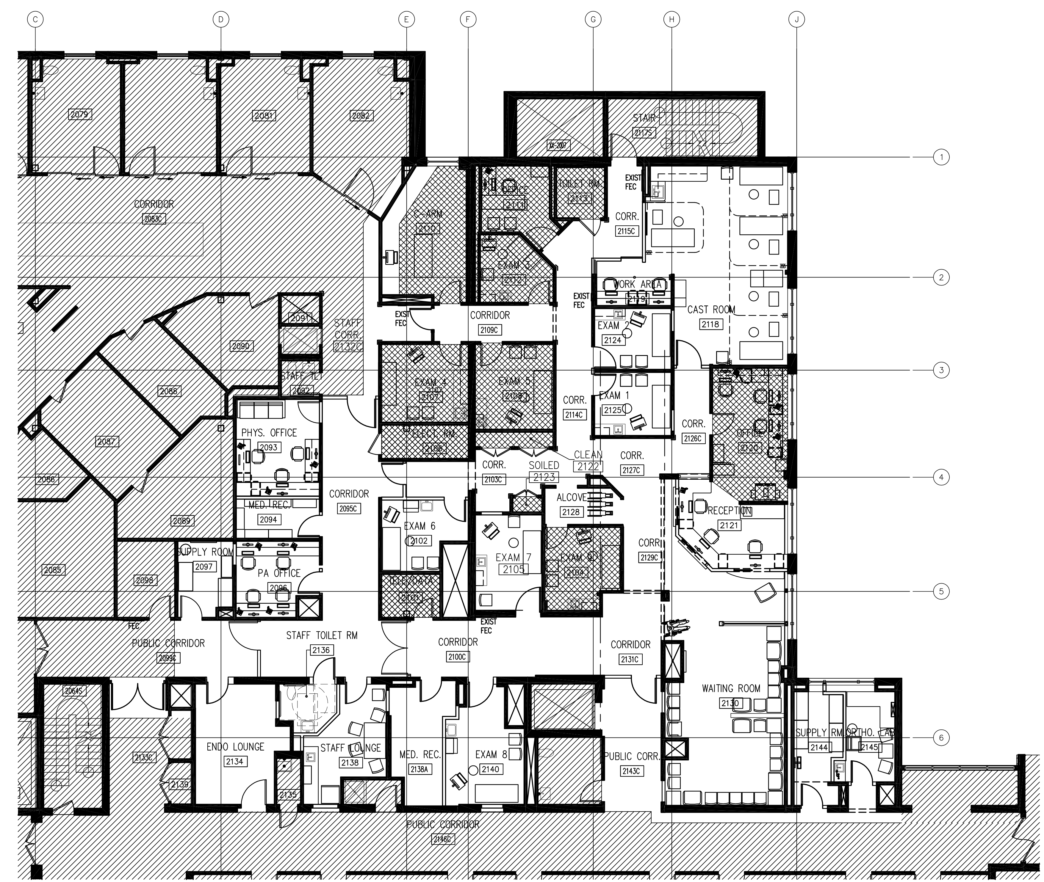
2 SECOND FLOOR FURNITURE & EQUIPMENT PLAN 1/8" = 1'-0"

NOTE: FURNITURE AND EQUIPMENT PLAN IS FOR REFERENCE ONLY. GC TO CONFIRM FINAL FURNITURE & EQUIPMENT PLACEMENT WITH OWNER.