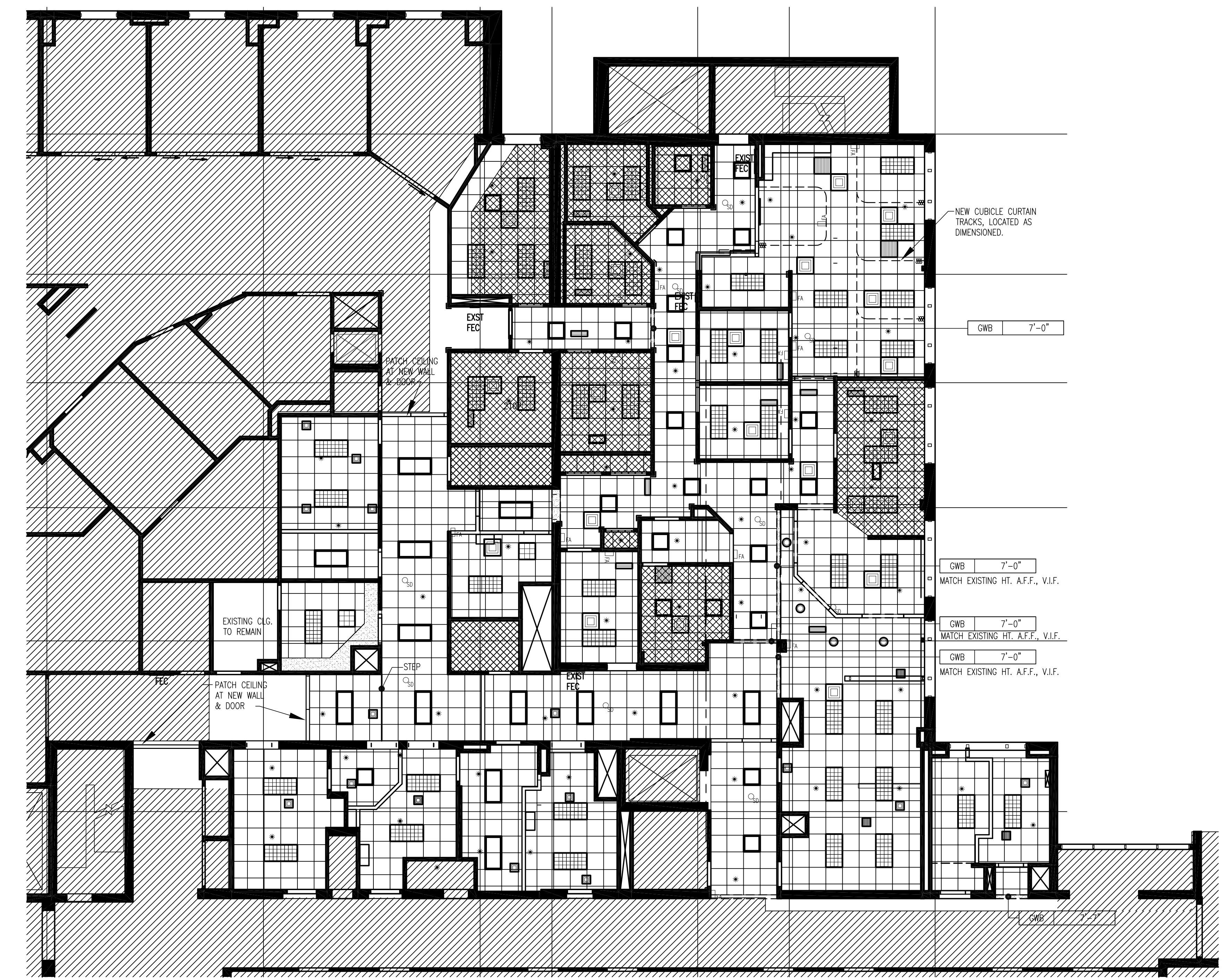
1 SECOND FLOOR REFLECTED CEILING PLAN 1/8" = 1'-0"

NOTE: FURNITURE AND EQUIPMENT PLAN IS FOR REFERENCE ONLY. GC TO CONFIRM FINAL FURNITURE & EQUIPMENT PLACEMENT WITH OWNER.