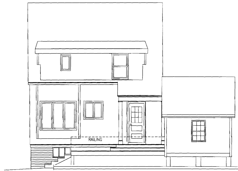
③ EXISTING EAST ELEVATION SCALE: 1/4"=1'-0"