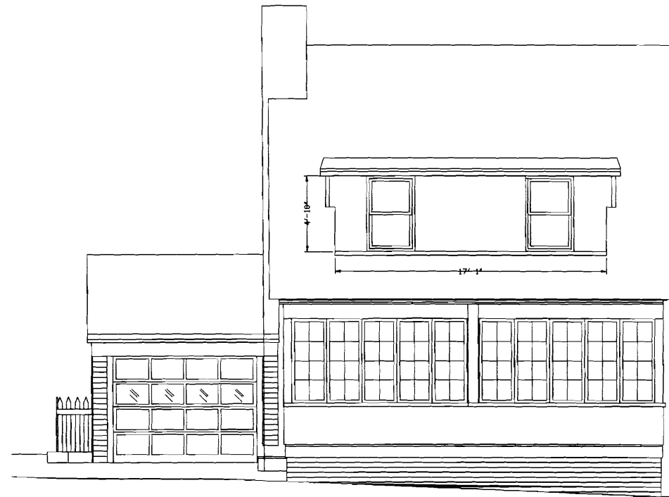
① EXISTING WEST (STREET) ELEVATION SCALE: 1/4"=1'-0"