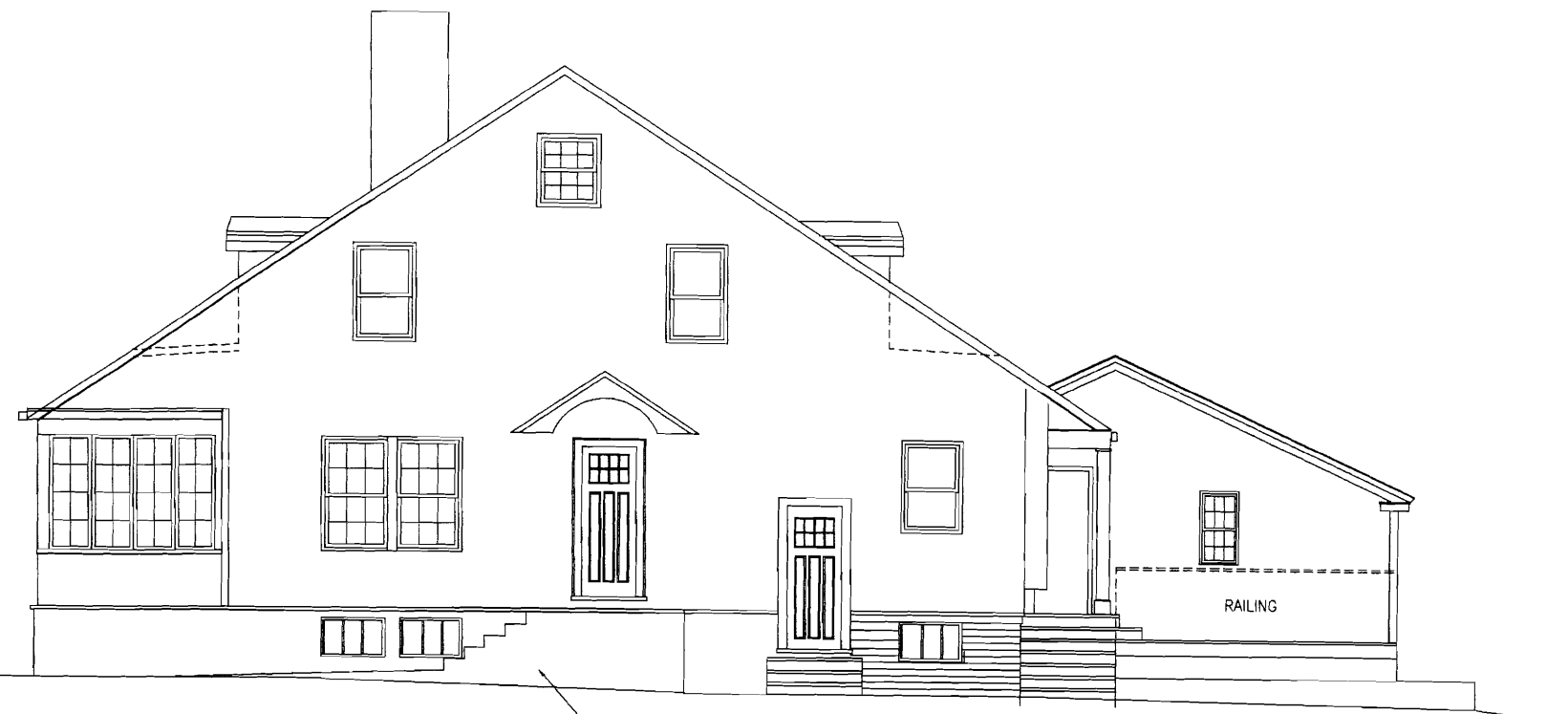
② EXISTING SOUTH ELEVATION SCALE: 1/4"=1'-0"