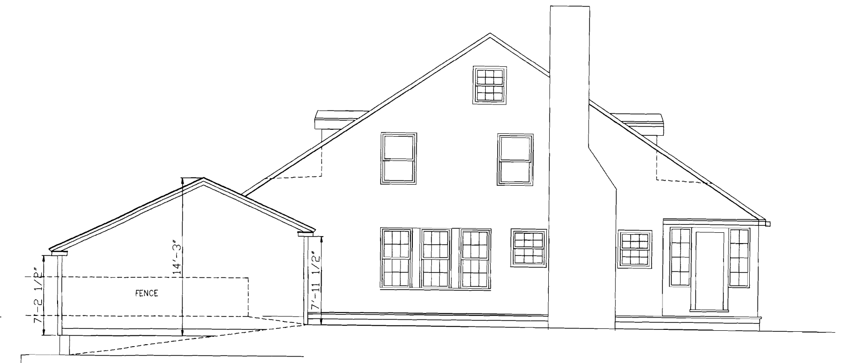
④ EXISTING NORTH ELEVATION SCALE: 1/4"=1'-0"