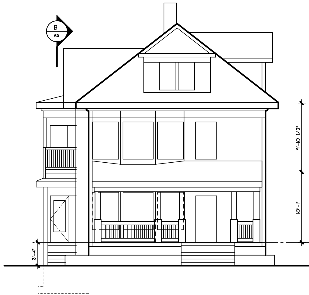
© SOUTH ELEVATION 1/8" = 1'-0"