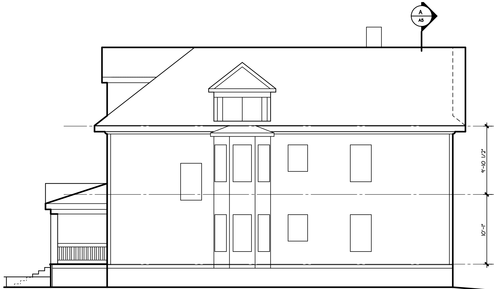
(B) EAST ELEVATION 1/8" = 1'-0"

PHASE 2: FRAME OUT ATTIC (NO PLUMBING IN BATHROOM) CREATE VAULTED CEILING IN DINING ROOM, INSTALL SKYLIGHT, RUN ELECTRICAL LINES, CLOSED CELL INS FOR HOT ROOF, INSTALL DRYWALL AND TRIM, REUSE WOOD PLANKS FOR WOOD FLOOR IN ATTIC LIVING SPACES REPAVE DRIVEWAY/REBUILD RETAINING WALLS (BY GC)