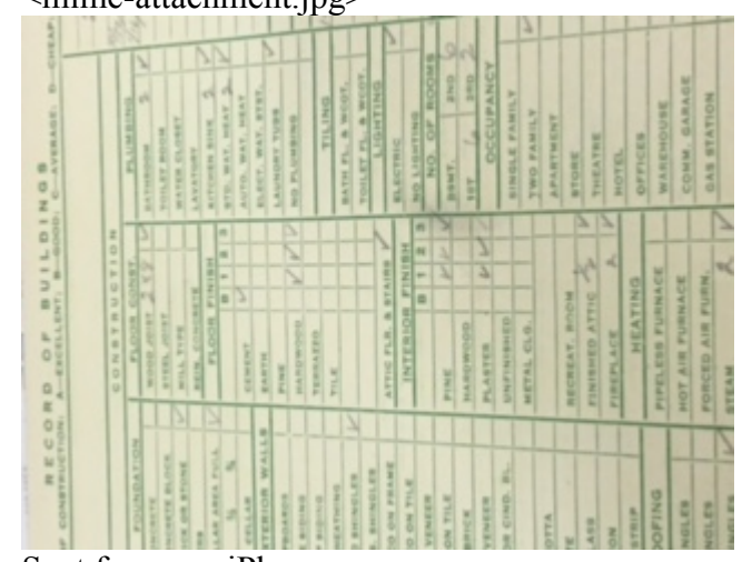
Sent from my iPhone

On Oct 30, 2015, at 3:20 PM, Christina Stacey <<u>cstacey@portlandmaine.gov</u>> wrote: