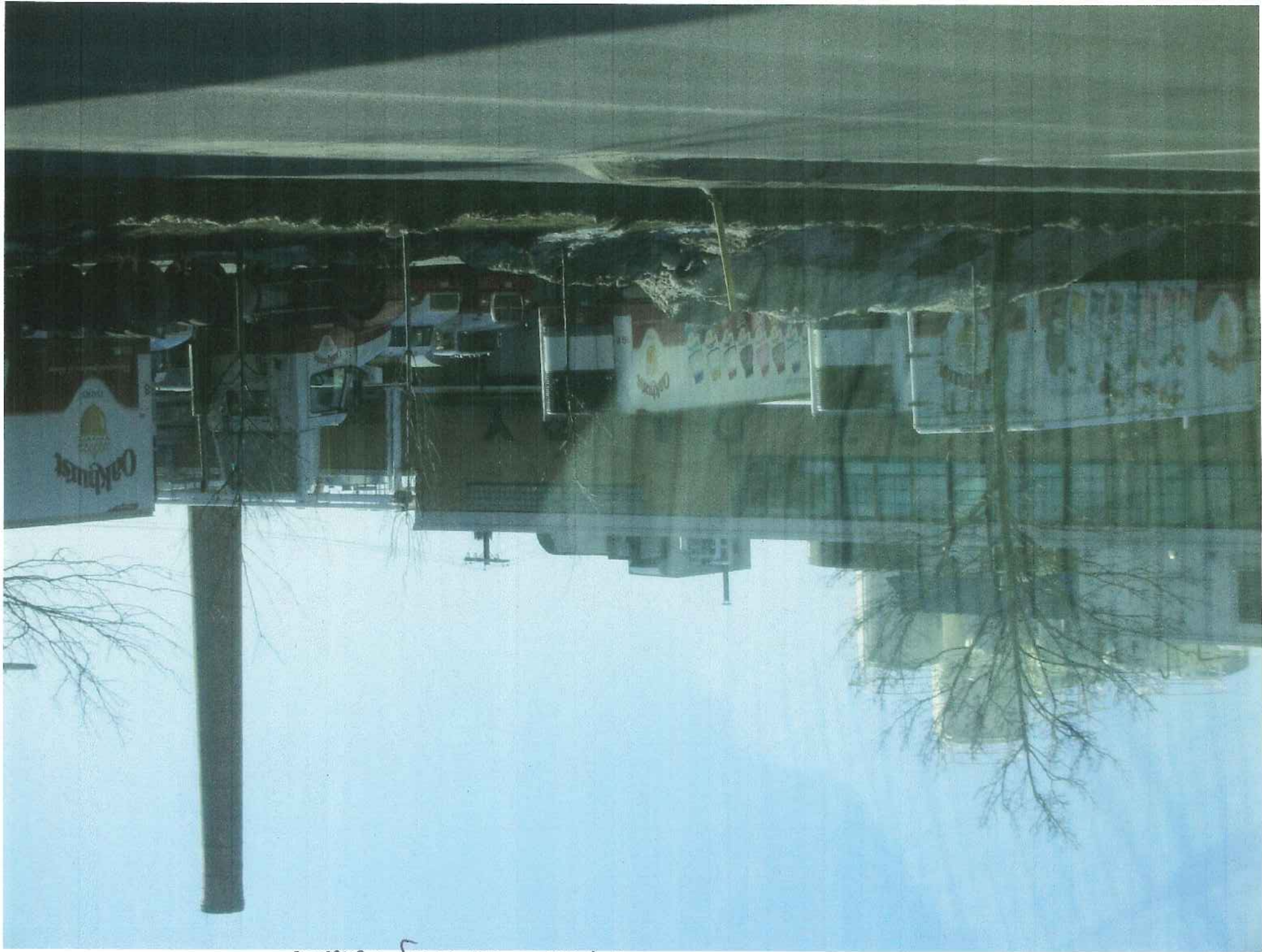
View of North Roof looking South