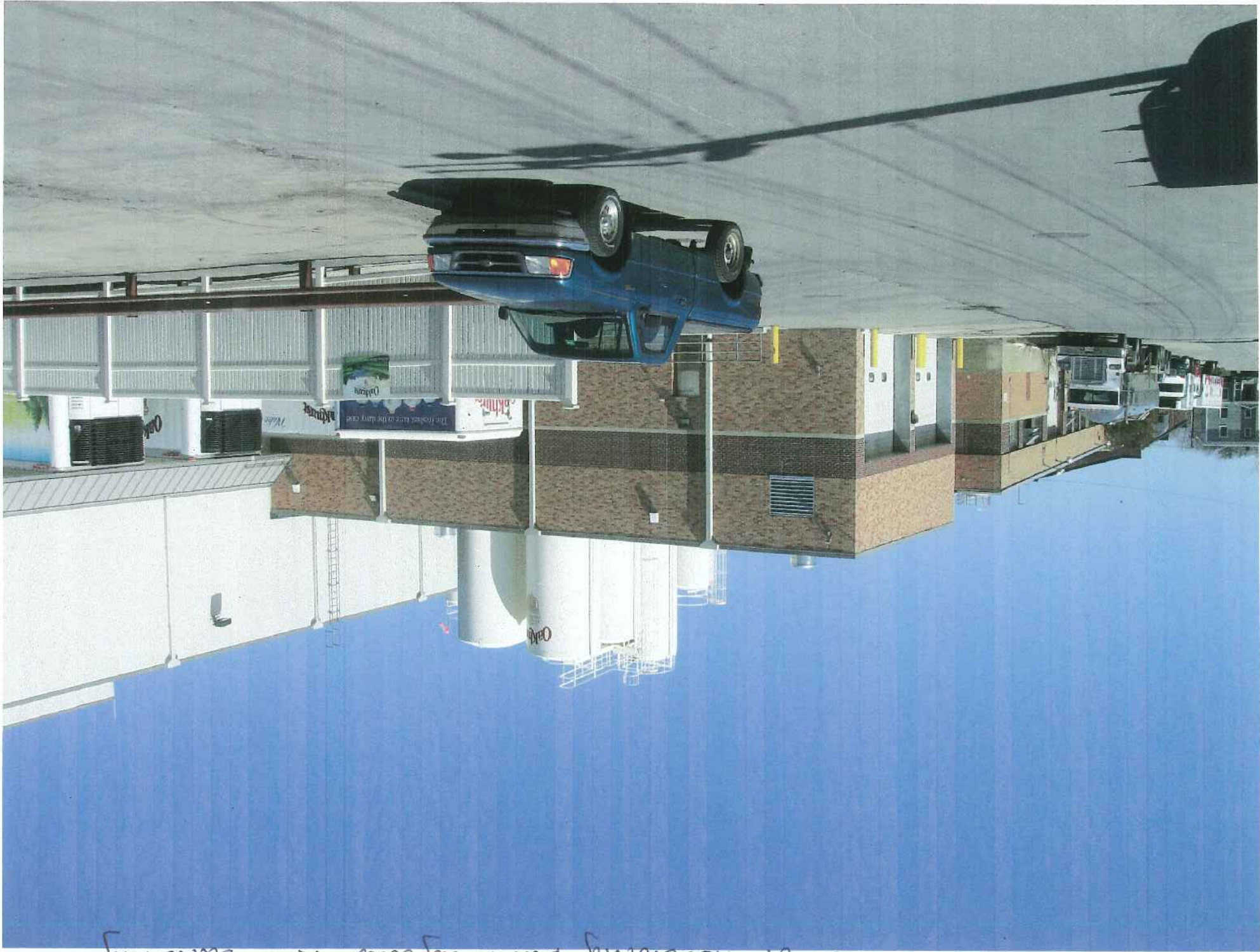
View of Receiving Building and Red Building