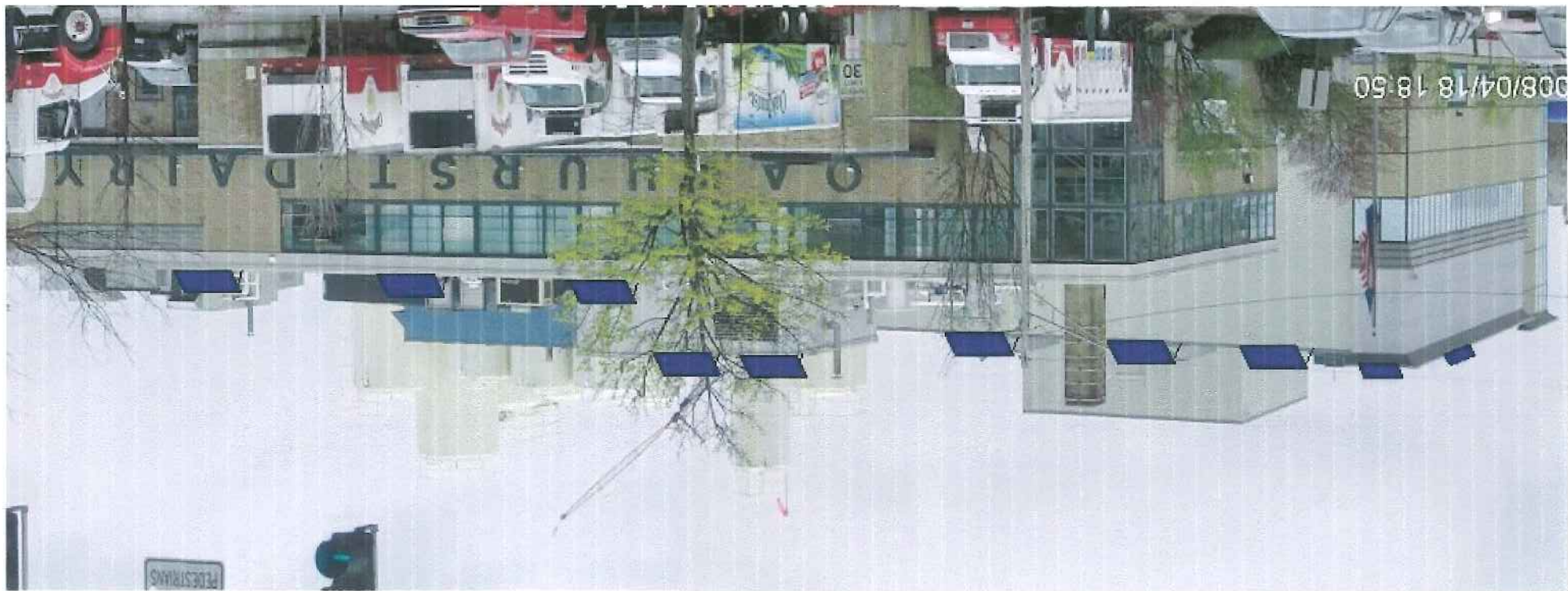
Conceptual View of Arrays from Forest Avenue Looking South