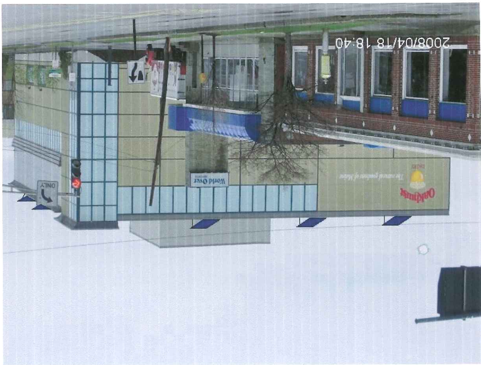
Oakhurst Dairy Solar Thermal System