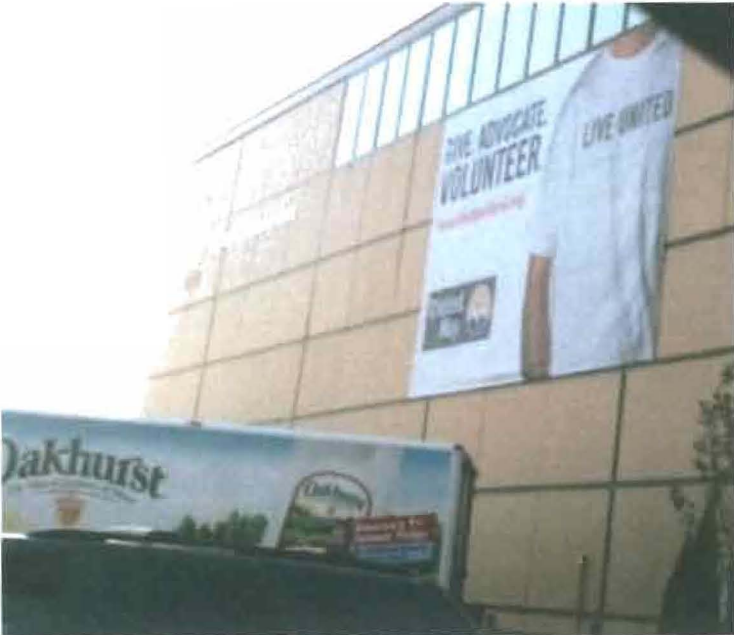
Oakhurst Dairy existing signage and banner image from 2009