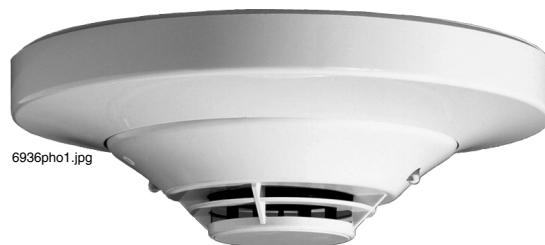
FST-851 Series in B710LP base