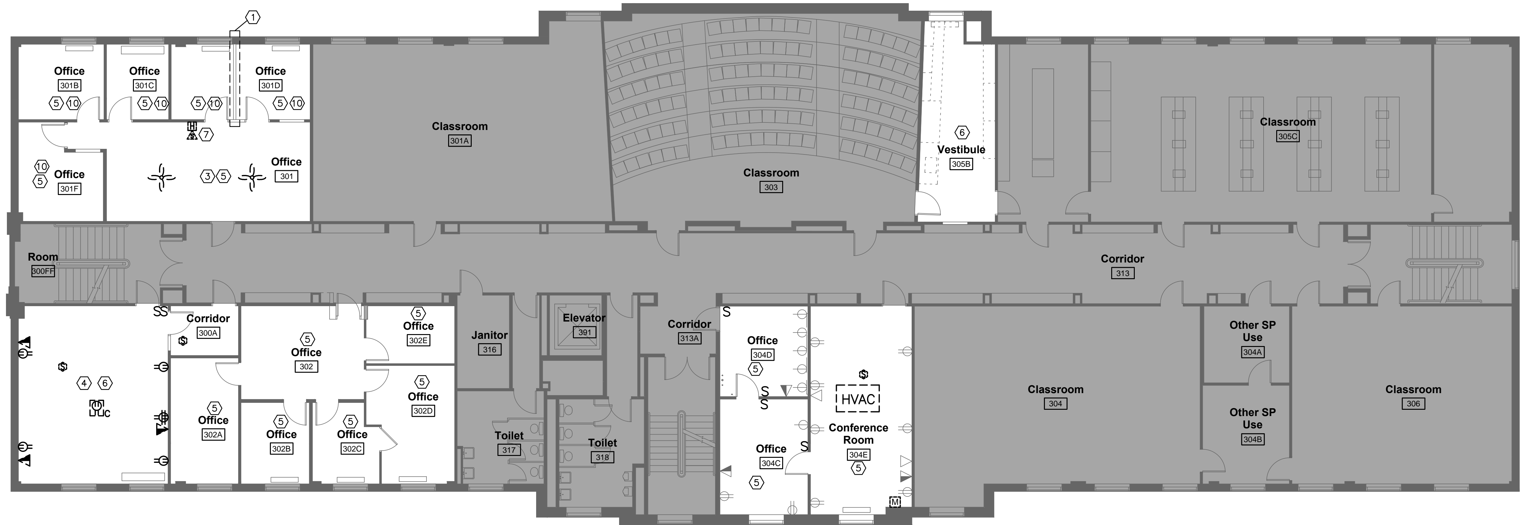
1 ELECTRICAL REMOVALS PLAN – POWER & SYSTEMS SCALE: 1/8"=1'