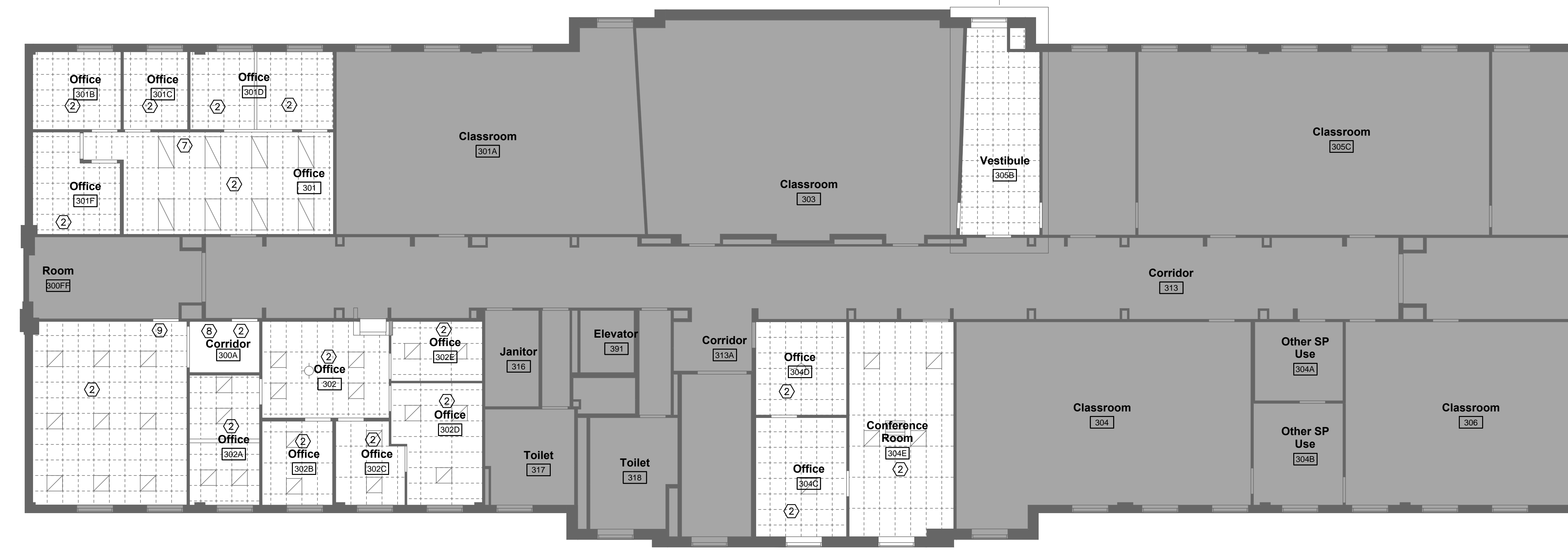
2 ELECTRICAL REMOVALS PLAN – LIGHTING & FIRE ALARM SCALE: 1/8"=1'