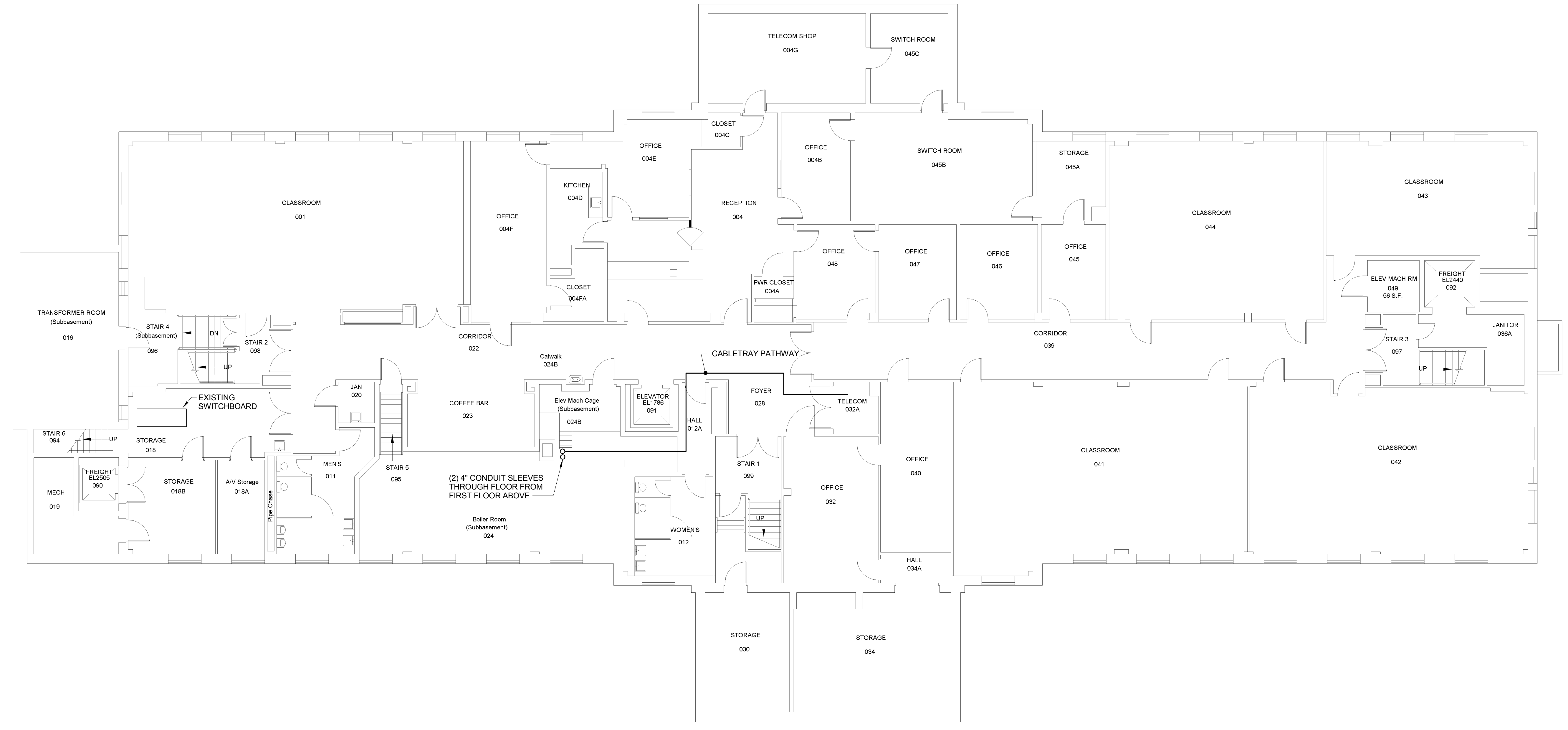
A1 BASEMENT FLOOR PLAN 1/8"=1'-0"

1/8/2015 7:54:16 AM N:\Projects\2014\0715 - USM Payson-05 Laboratory Renovation\00 Drawing Files\44705_E_R15.rvt