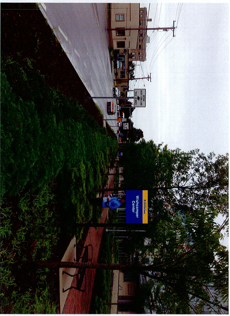
Wiscamper Center @ Bedford St.

Notes: The drawings are the property of Wiscamper Associates Inc. and shall not be reproduced without the written consent of Wiscamper Associates Inc. All design and construction shall be the responsibility of the fabricator. © 2013 2014 Wiscamper Associates Inc. 07/27/13