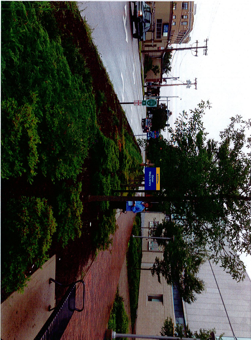
Osher Map Library @ Bedford St.

Notes: This drawing is the property of Woodworth Associates Inc. and is not to be reproduced or used in any way without the expressed written consent of Woodworth Associates Inc. All rights reserved. Drawings represented in this set-up are the design intent only. Final construction drawings to be prepared by Woodworth Associates and Richardson & Associates.