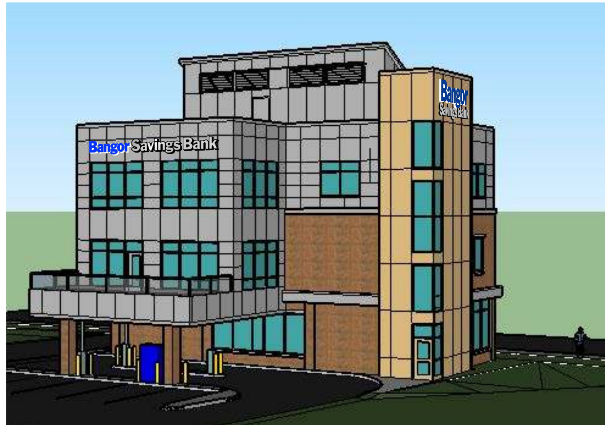
VIEW FROM THE WEST