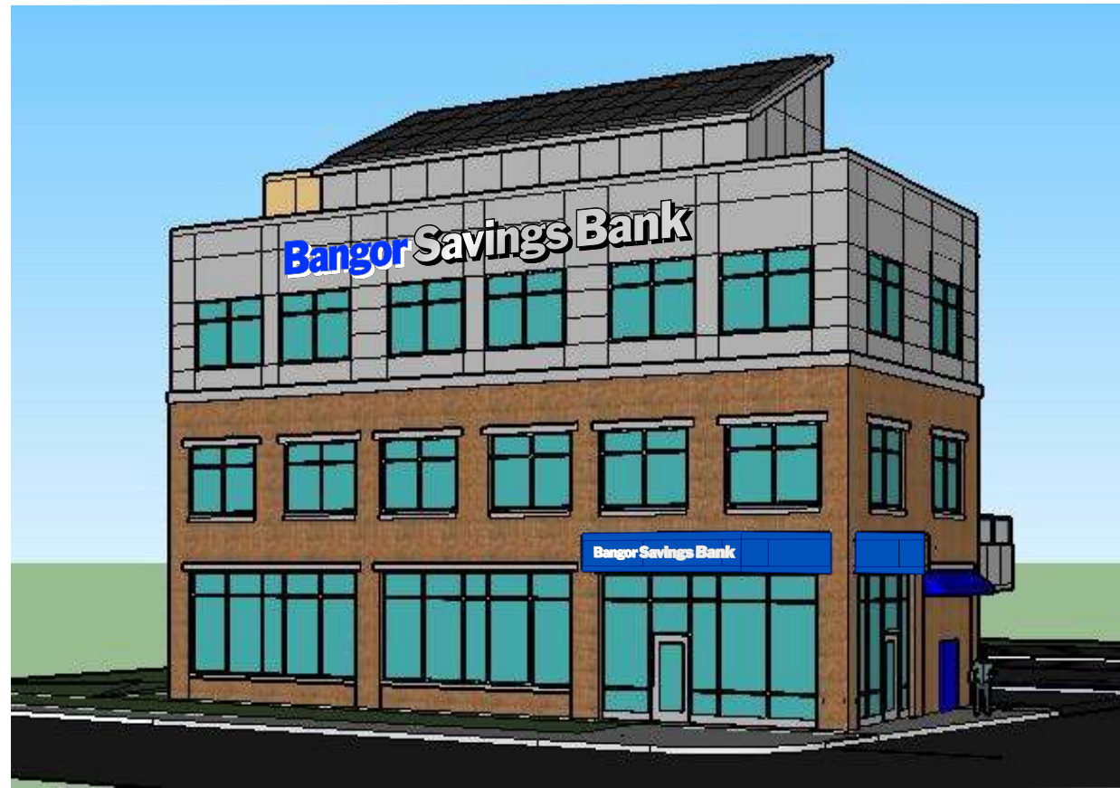
VIEW FROM THE EAST