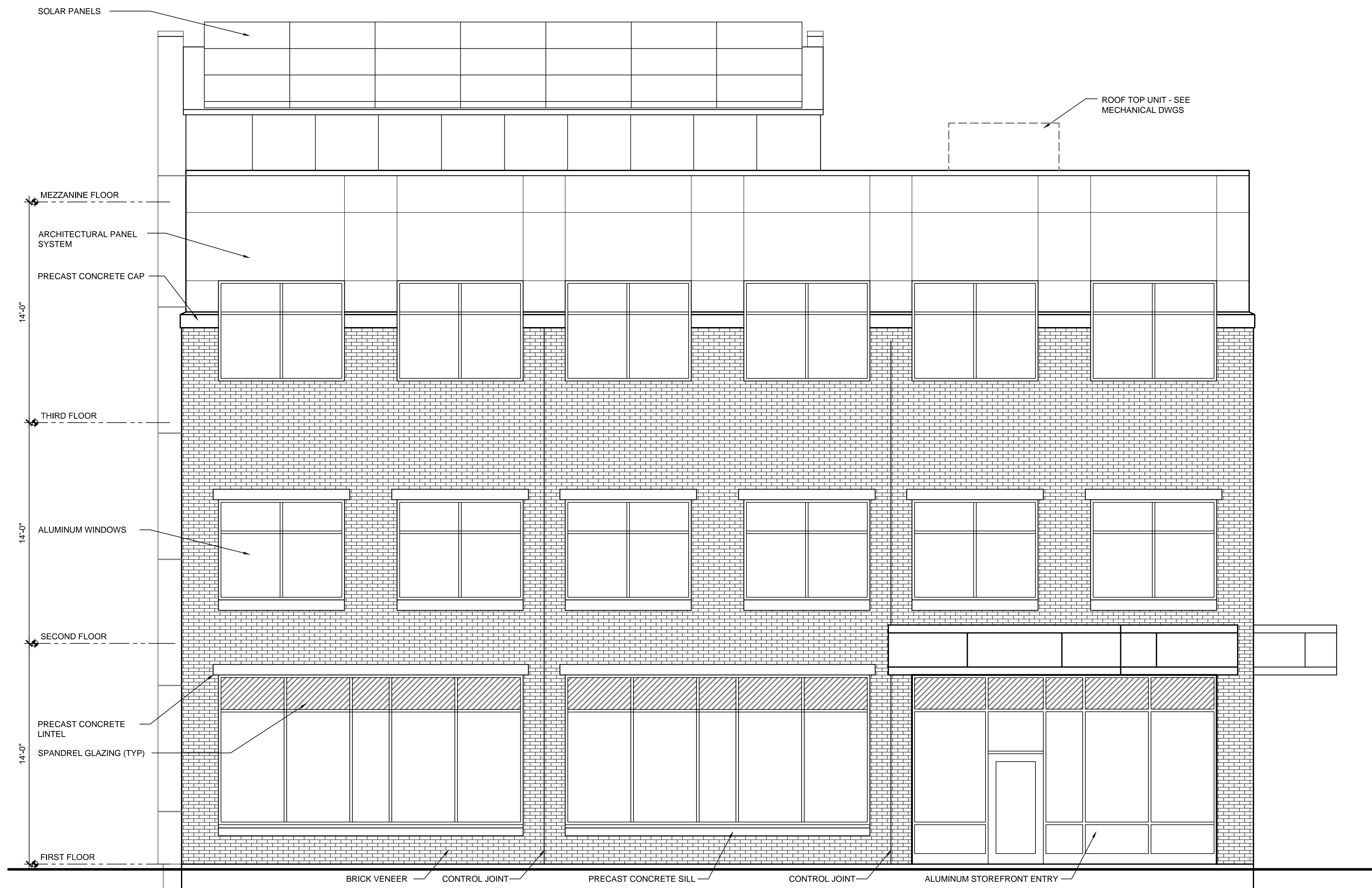
A1 FRONT ELEVATION 1/4" = 1'-0"