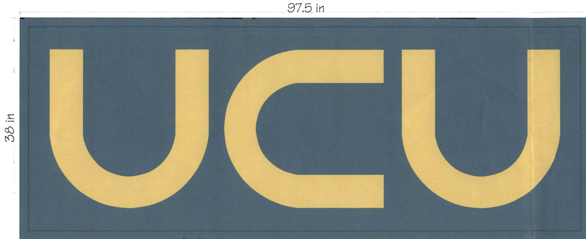
1.5" Retainer • Internally Illuminated Wall-Mount Sign (w/Brighton style dimensional faces) Colors: Trans Dark Blue & Trans Gold Nugget