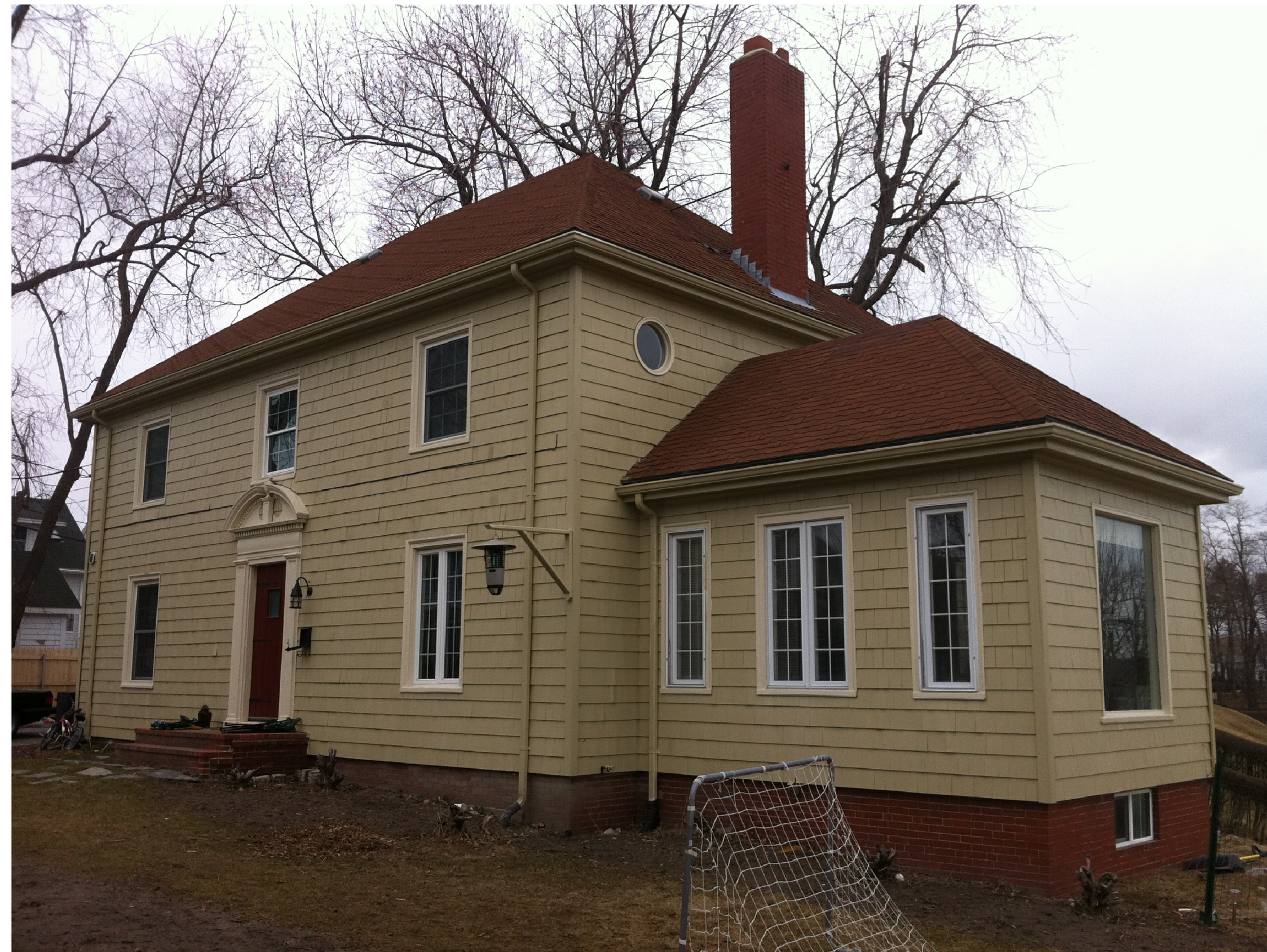
PHOTOGRAPH OF EXISTING SOUTH FACES

120 BAXTER BOULEVARD PORTLAND, MAINE 04101