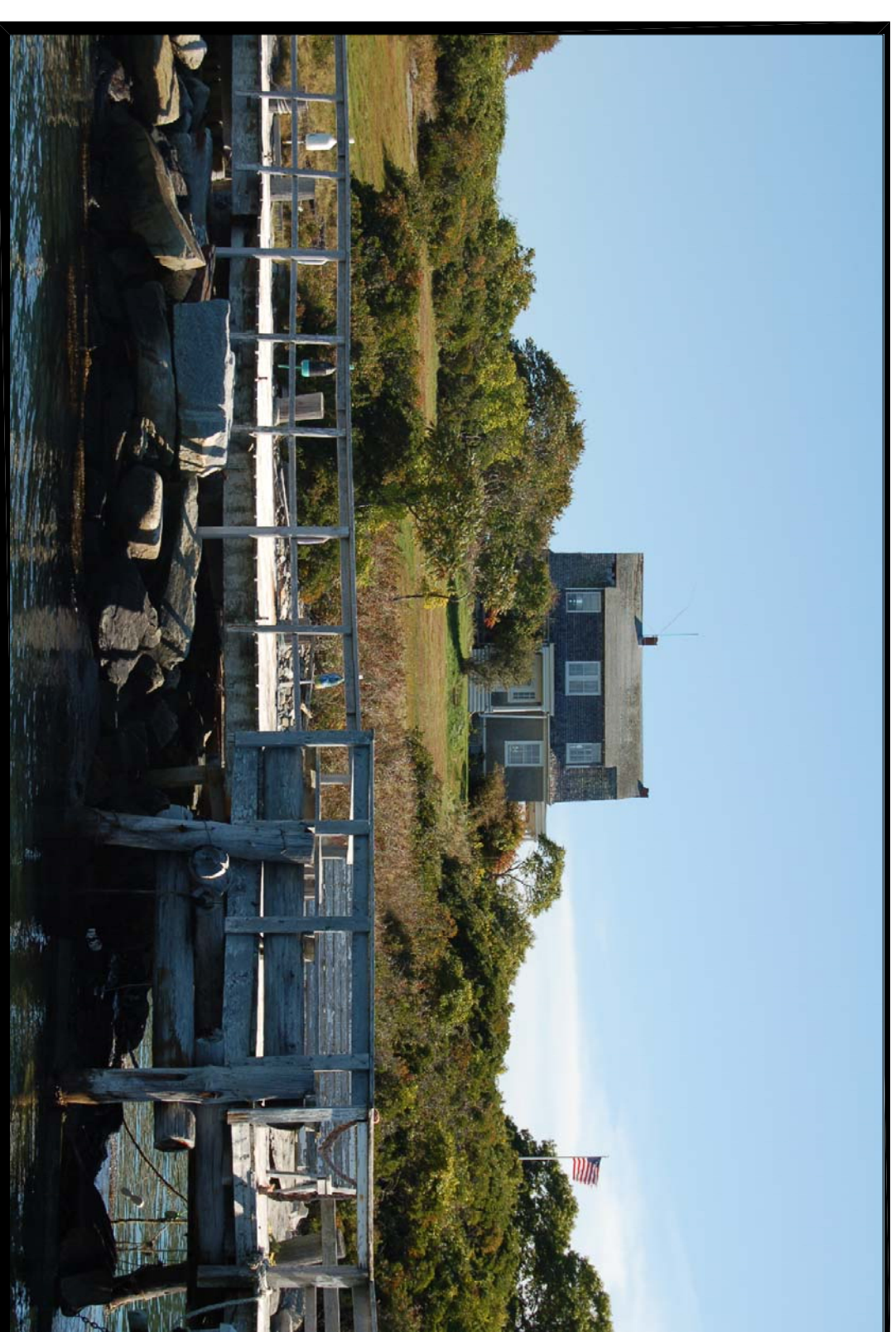
Former Doctor's Residence (Building #2)