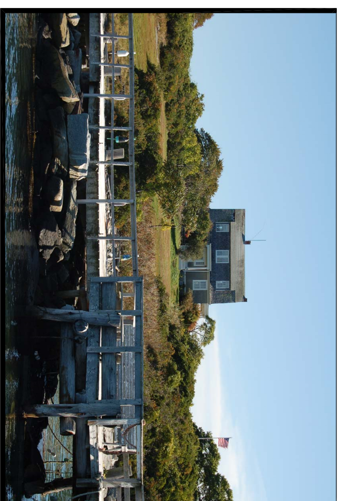
Building #2 Christina's World