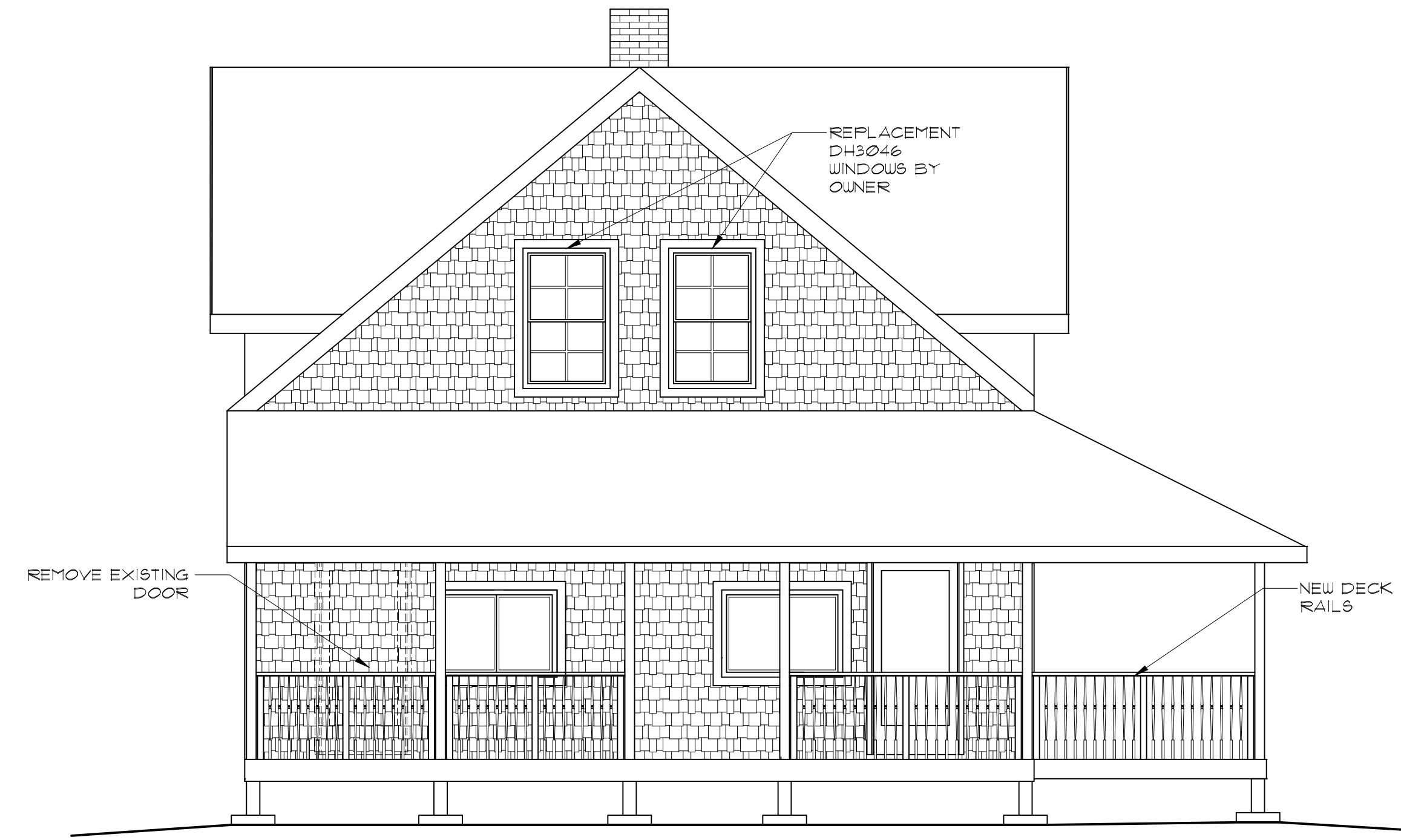
RIGHT SIDE ELEVATION SCALE: 1/4"=1'-0"