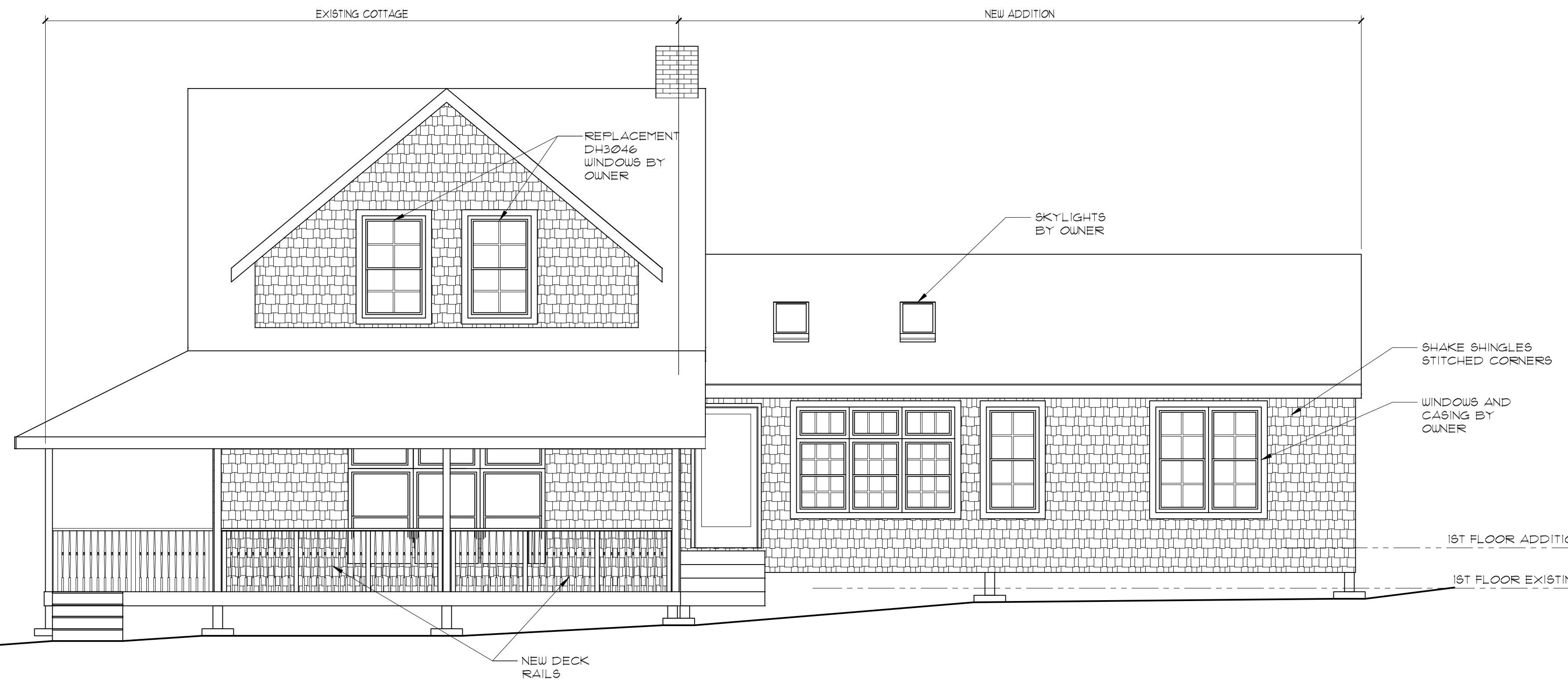
FRONT ELEVATION SCALE: 1/4"=1'-0"