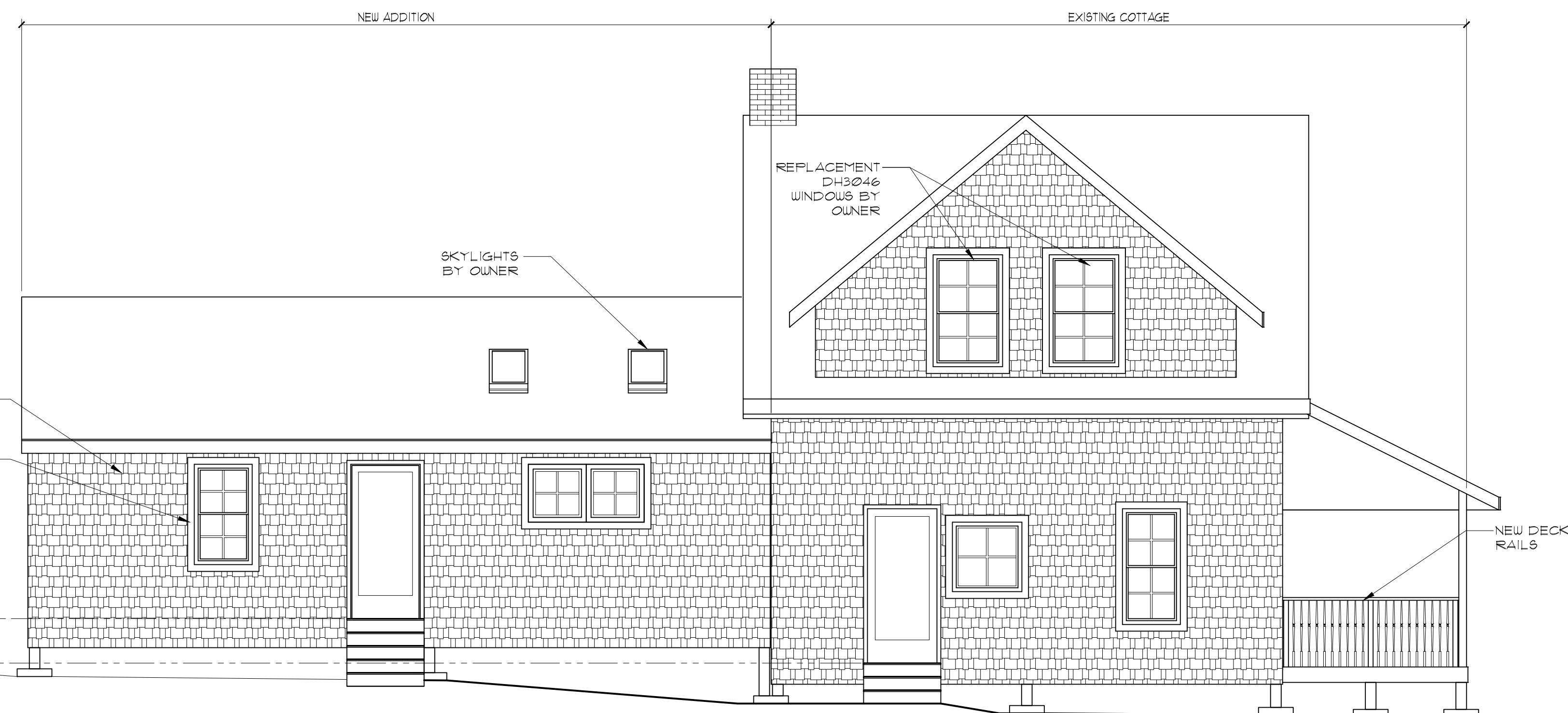
REAR ELEVATION SCALE: 1/4"=1'-0"

NOTE: THIS DRAWING IS PROVIDED FOR INFORMATIONAL PURPOSES ONLY. IF USED FOR CONSTRUCTION, THE CONTRACTOR ASSUMES ALL RESPONSIBILITY FOR LOCAL CODE COMPLIANCE. ALL DRAWINGS, PLANS, SKETCHES, ETC. ARE PROVIDED TO OUR CLIENTS BASED UPON INFORMATION PROVIDED BY THE CLIENT AND DRAINED IN ACCORDANCE WITH COMMON BUILDING PRACTICES AND LOCAL CODES. NONE OF THE EMPLOYEES OF FMC CADD DRAFTING SERVICES, INC. ARE REGISTERED ARCHITECTS, ENGINEERS OR LAND SURVEYORS. ALL DIMENSIONS AND SPECIFICATIONS SHOULD BE VERIFIED BY CLIENT AND/OR CONTRACTOR BEFORE ACTUAL CONSTRUCTION BEGINS. IF DIMENSIONS AND SPECIFICATIONS ARE NOT VERIFIED BY CLIENT AND/OR CONTRACTOR BEFORE ACTUAL CONSTRUCTION BEGINS, FMC CADD DRAFTING SERVICES, INC. WILL BE HELD HARMLESS. FMC CADD DRAFTING SERVICES, INC. ASSUMES NO LIABILITY FOR CHANGES AND/OR REVISIONS MADE TO PLANS BY CLIENT AND/OR CONTRACTOR.