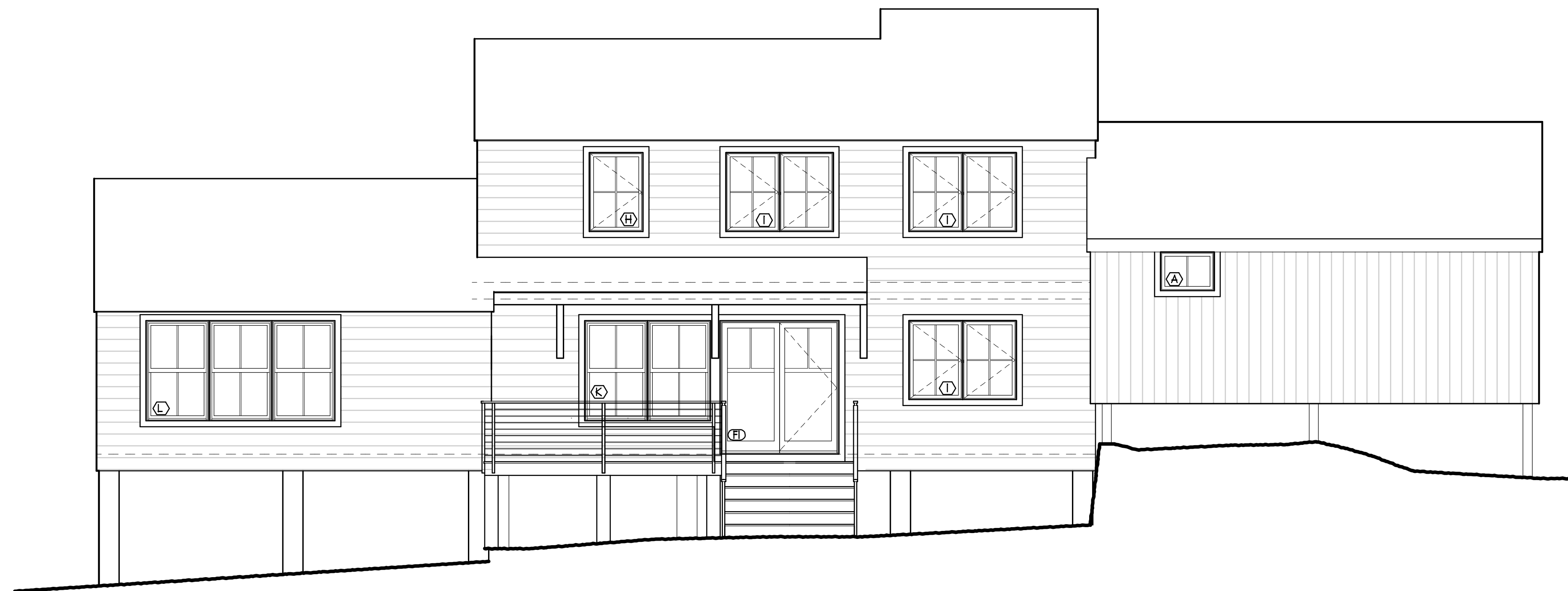
2 WEST ELEVATION A2.4 1/4"=1'-0"