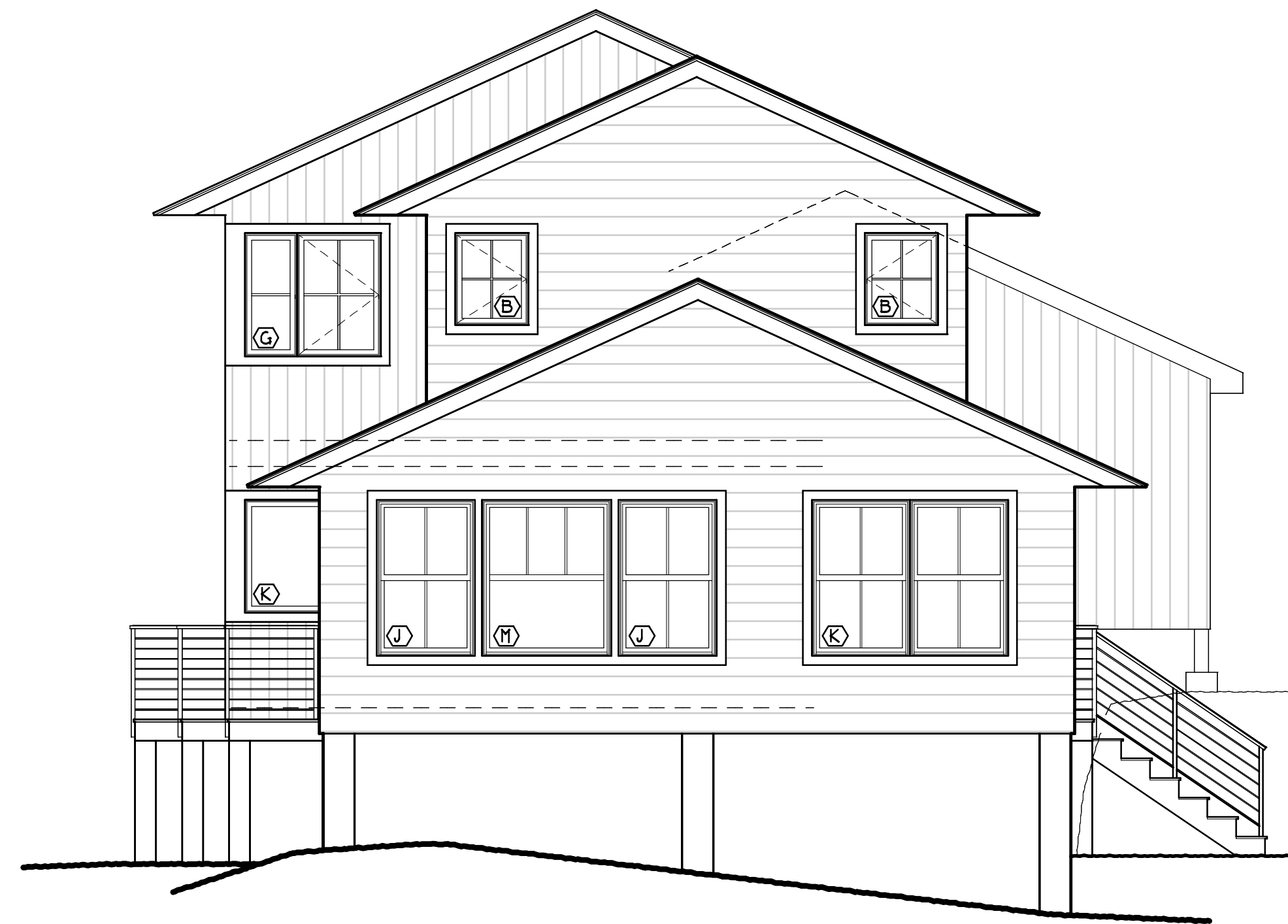
1 NORTH ELEVATION A2.4 1/4"=1'-0"