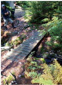
(left) Rustic foot bridge to be replaced.