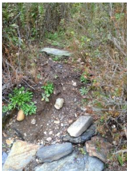
(Left) Stone steps needing repair