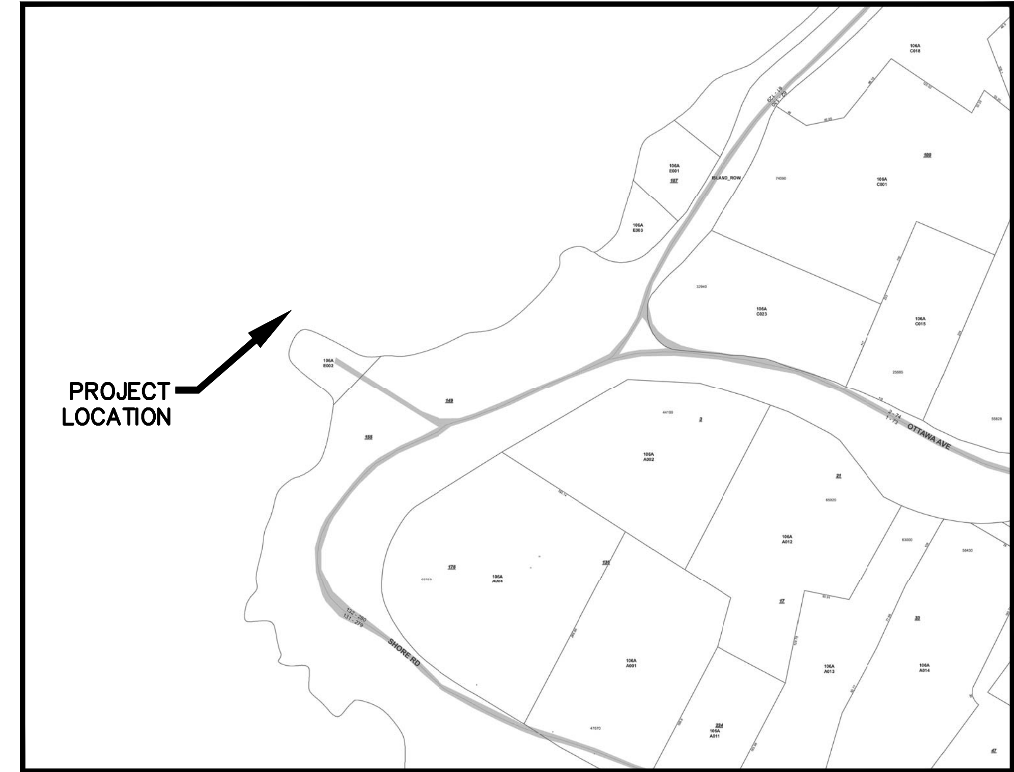
CITY OF PORTLAND TAX MAP #C14SW