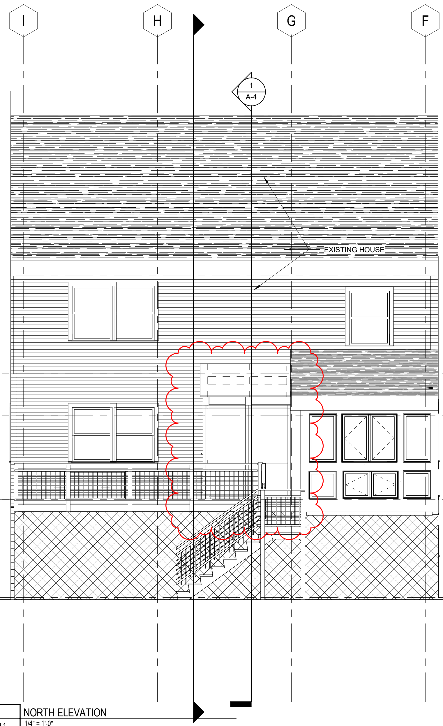
1 NORTH ELEVATION A-3.1 1/4" = 1'-0"