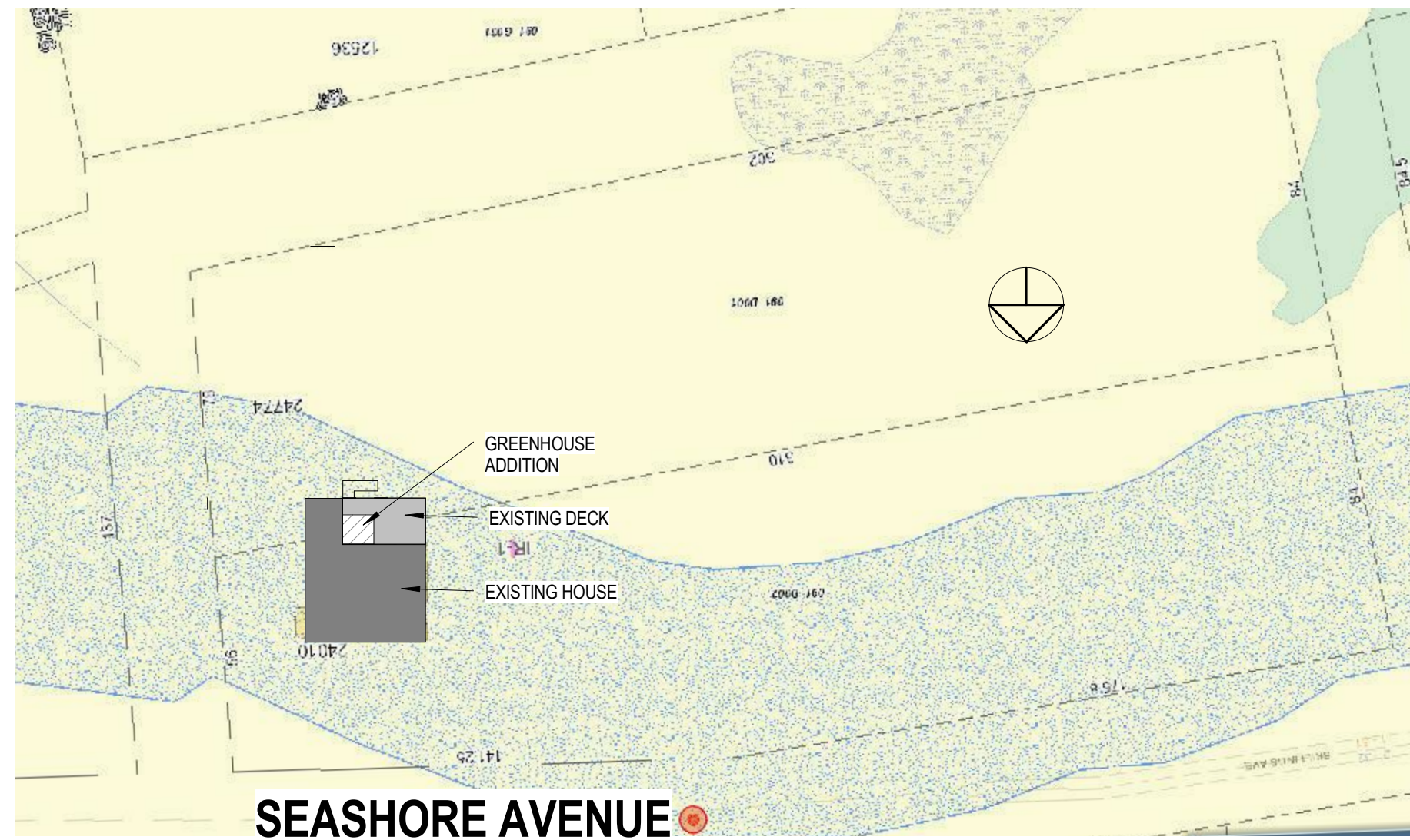
3 SITE PLAN A-1 1" = 40'-0"

VOLUME OF EXISTING HOUSE EXCLUDING PREVIOUS SHED (NOT PERMITTED BY PREVIOUS OWNER) = 19,560 CU FT VOLUME OF GREENHOUSE ADDITION AND SHED = 1,919 CU FT TOTAL VOLUME INCREASE OF 10%