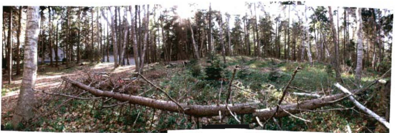
F - View from southeast corner of property, looking from southwest to northwest (looking at building zone)