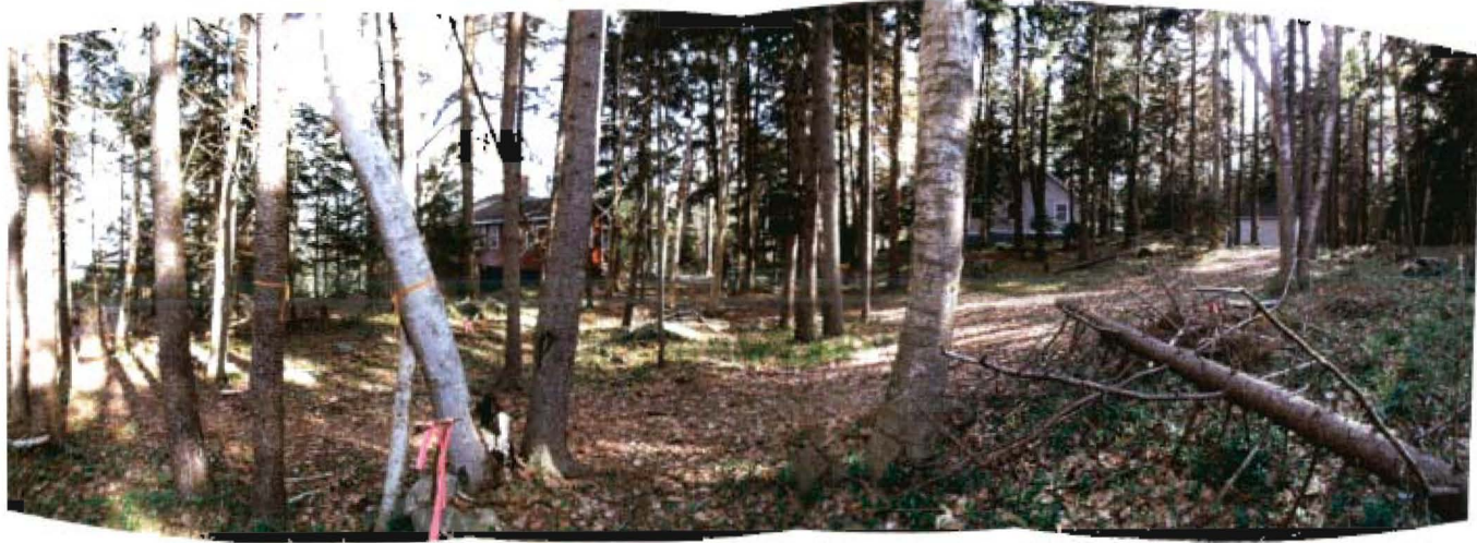
E - View from southeast corner of property, looking from southeast to southwest