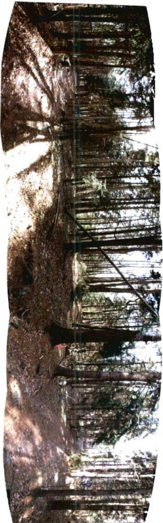
C - View from right-of-way looking north, panning from west to east