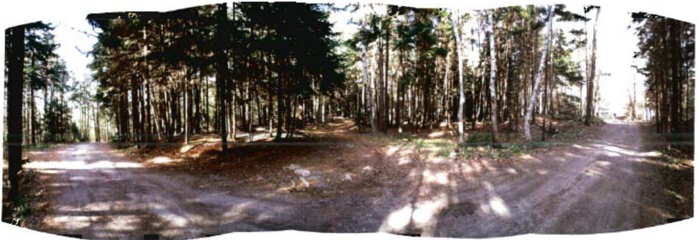
A - View looking east, panning from north to south on Tolman Road - looking down the intersection of the right-of-way