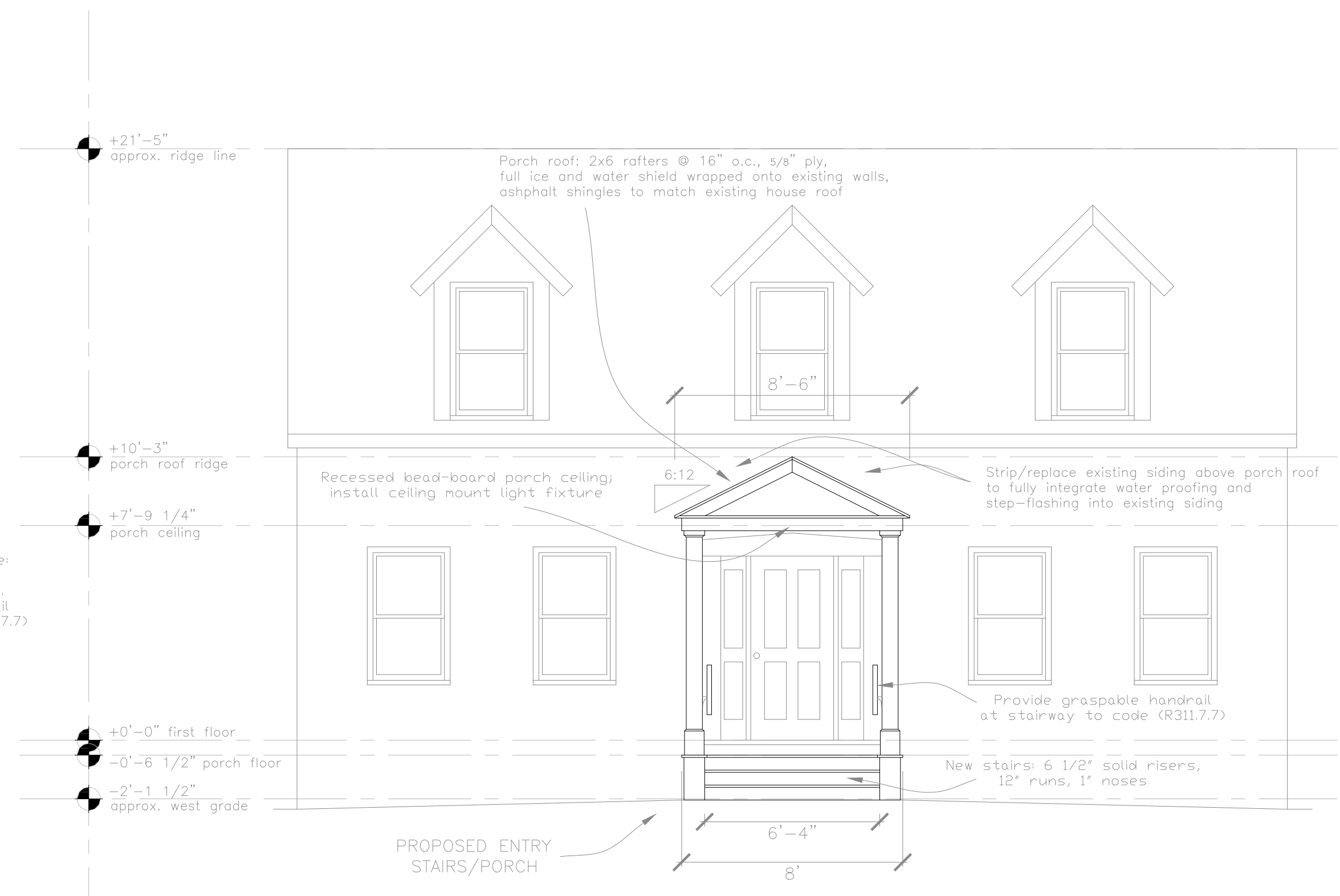
B Proposed West Elevation 1/8" = 1'-0"