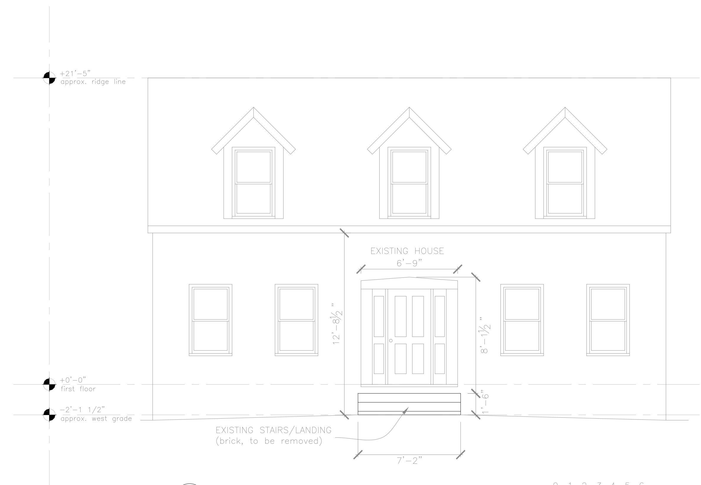
(B) Existing West Elevation 1/4" = 1'-0"